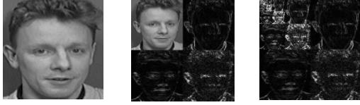
Figure 1a. Face image from AT&T Database of Faces