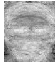
Figure 3 Inter to intra class ratios of DWT coefficients

The purpose of DWT coefficient selection is to select the most discriminative DWT coefficients. This proceeds by wavelet transforming each training image and extracting the low-pass coefficients to form the image’s observation vector. The inter-class and intra-class standard deviations for each coefficient are calculated and the ratio of these values is determined. This ratio indicates how tightly the coefficient’s values are clustered within a class compared to the spread within the complete training dataset. The coefficients with the highest ratios are deemed to be the most discriminative and are used for recognition. Figure 3 illustrates the ratios visually. The brighter areas in the image represent DWT coefficients with higher inter-class to intra-class ratios.