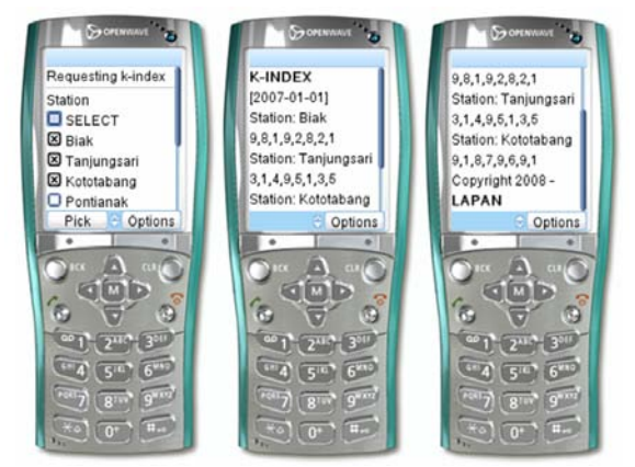
Figure 5. An example of query results in requesting k index for multiple stations on January 1<sup>st</sup>, 2007.

Services related to ionospheric anomaly are GPS correction and scintillation. LAPAN has GPS receiver dedicated to research and its applications located at Bandung and Pontianak. Using these GPS data, it is possible to monitor condition of ionosphere. If there is anomaly, an alert can be uploaded to WAP server so that the users can browse information via a mobile phone.