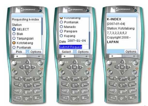
Figure 4 . An example of query result in requesting k index from Kototabang station on January 4<sup>th</sup>, 2007.