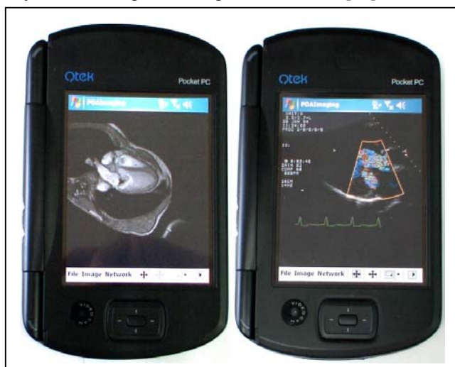
Fig. 3. High resolution images can be sent wirelessly to the mobile consultant, either within or outside the hospitals vicinity.

The former behaved more or less as expected. The PDA was capable of videoconferencing in a number of resolutions ranging between 176x144 and 352x288 pixels. Although the necessary bandwidth for the highest resolution was available without any major dropping of the frame rate, it was rarely used, as it will impose an additional load to the wireless network that might prevent other people accessing it. The frame rate varied between 5 and 15 frames per second, depending on the distance between the mobile user and its associated AP (802.11 connection speed falls back to 5.5, 2 and 1 Mbps as the signal deteriorates). When the movement of the source camera increased, the image on the receiving end appeared relatively "squared" but this is to do with the way that the compression algorithm behaves [10].