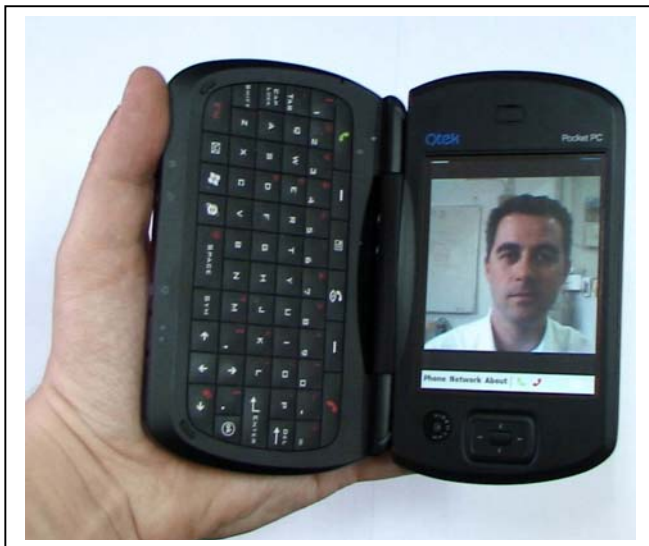
Fig. 2. Mobile videoconferencing while within a hospital: the medical consultant only has to carry a light PDA.

Network access could be established in a number of ways but by default it started with IEEE 802.11b (11Mbps) and whenever the device could not find an access point, it reverted to a 3G connection (UMTS) through the mobile network and with a maximum speed of 384 Kbps [7].