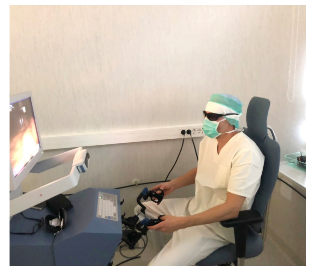
Figure 3. Surgeon works at console