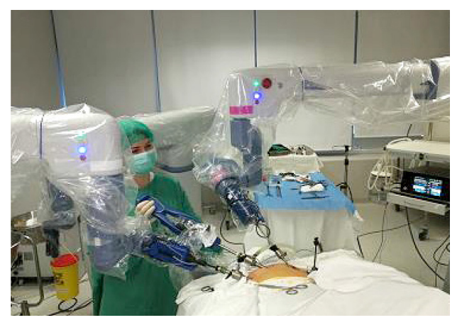
Figure 1. Docking of robotic arms

The robotic-assisted operations were performed with the Senhance system (TransEnterix, Inc., Morrisville, NC, USA). We participated in a 4-day intensive training program with this system at the European training center of TransEnterix Inc. in Milan. Surgeons and nurses of our team were able to use the robot over several hours. The training was concluded with procedural performances in an animal model, a test, and a certificate being Figure 2. Robotic dissection in process