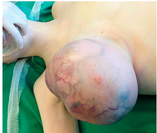
Figure 1. Pre-operative view of the tumor

Breast ultrasound examination revealed a large heterogeneous solid mass with internal vascularity replacing left breast tissue. The size was difficult to define on ultrasonography due to its large size. Breast tumor was without signs of invasion to the chest wall and to the axillary, supraclavicular and infraclavicular lymph nodes. Ultrasound of the abdomen without pathology. Due to the large size of the tumor, we did not perform mammography.