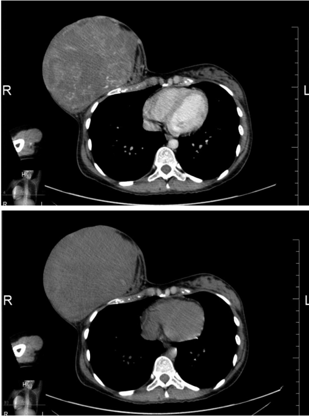
Figure 2. Chest CT scan

Chest and abdominal CT scan with ultravist 300 examination: right breast dimensions 174 mm × 123 mm × 166 mm round shape, well-defined margins, heterogeneous internal structure, consisting of lobules with blood perfusion and cavities of tissue destruction. Tumor without signs of invasion to the chest wall and axillary, supraclavicular and infraclavicular lymph nodes. Chest and abdomen CT scan – without pathology (Figure 2). Differentiate with tumor phyllodes and angiosarcoma.