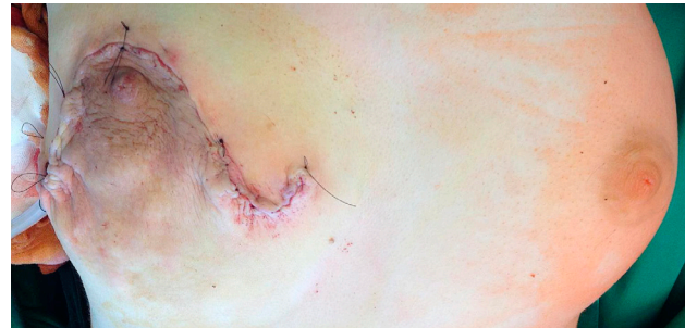
Figure 4. Nipple-sparing mastectomy after completion