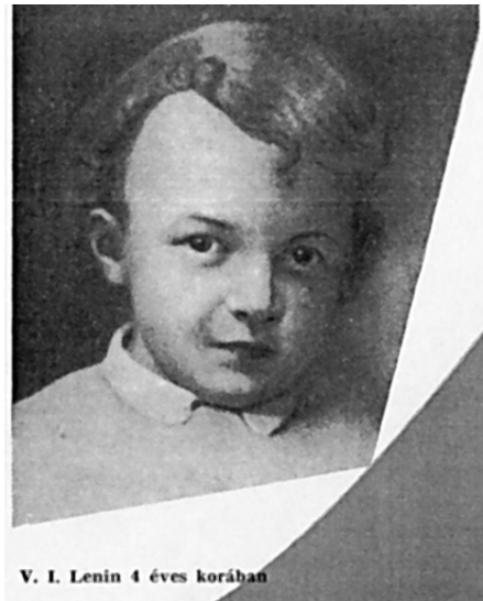
Picture 4. V. I. Lenin at the age of 4. Úttörővezető ("Pioneer-Leader"), 1963, Vol. 17. No. 4., inside cover.

The relationship and interactions between photography and painting was an important topic to pictorialism, a decisive trend in visual representation during the late 19 th and early 20 th centuries. Representatives of this direction interpreted photographs as paintings, or similar artworks, and created scenic photos with a lack of sharp focus (Tóth 2010); like the fourth picture (a painting), which was probably grounded on the previous pho-