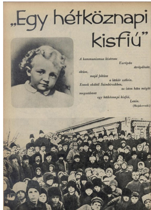
Picture 2. A Boy Like Any Other. In Gyermekünk (“Our Child”), 1970, Vol. 2. No. 4. page 18.

Every eye on this page stares to the viewer, who is going to read the whole setup overall and its parts separately: this is a multimodal experience, with verbal and visual effects utilized all at the same time (Fendler 2017). The montage can be seen through different political lenses; one is following the original intentions, image, and prognosis of the future leader of the workers’ movement and the new society, anticipating revolution, a unity of the individual and the masses. The other approach discovers the working process of the propaganda, reflecting to the idea of the paternal state and its children, the citizens, or the child as a symbol of the new state (Pinfold 2011), describing how the founding myth was demonstrated, what tools were used, etc. From this layout, one