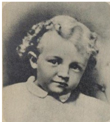
Picture 1. A Boy Like Any Other (detail). In Gyermekünk (“Our Child”), 1970, Vol. 2. No. 4. page 18.

Celebrations were very important in the communist system: both the repetitive ones every year and the single jubilees. For example, the 20 year-anniversary of Hungary's liberation (1965) was one of these: the Second World War ended in Hungary on April 4, 1945, when the last German troops and their Hungarian allies were expelled by the Soviet Army. After that, April 4 became an official holiday in the occupied country, and the Red Army stayed in Hungary until 1991. Half century-anniversaries followed: the “Great October Socialist Revolution” in 1967, the Hungarian Soviet Republic in 1969, and the next year (1970) was Lenin's centenary. A festive calendar can be compiled from the anniversaries and celebrations in the socialist Hungarian society – a liturgy, which