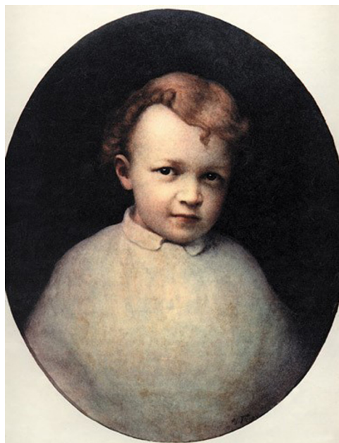
Picture 5. Parkhomenko, Ivan: V. I. Lenin at the age of 4 (1924). Retrieved on July 15, 2016, from https://commons.wikimedia.org/wiki/File:Lenin_V_I_at_age_of_4.jpg

tographs. Ivan Parkhomenko was the artist (1870–1940) who made this oil on canvas in 1920 (Lenin/Ivan Parkhomenko). The painter combined realism with transcendence to suggest the unique character of a real individual. We can observe the original features of the photograph (the child’s face, hair, and shirt), but the backstage completely disappeared on the artwork – an opposition of the white figure and black foreground reflects pictorialism and a super-reality. Conversions between the two modalities, a translation from the painting to photography meant an important problem in the age of mechanical reproduction (Benjamin 2008), while the inverse direction (from photography to painting) implies the sublimation of the real figure and historical context into art and the sacral world. Lenin had existed at different levels; reality and myth interfere into each other in these representation spaces. The last (fifth) picture shows the original painting.