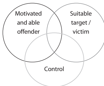
FIGURE 3. The third element: control

The third element is insufficient control.