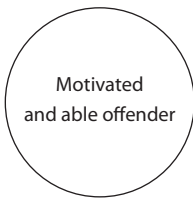
FIGURE 1. The motivated and able offender

Given this framework, crime is a simple thing, as pointed out by Marcus Felson. It is composed of three logical elements that are required for a crime to take place: the perpetrator, target/victim, and insufficient control.