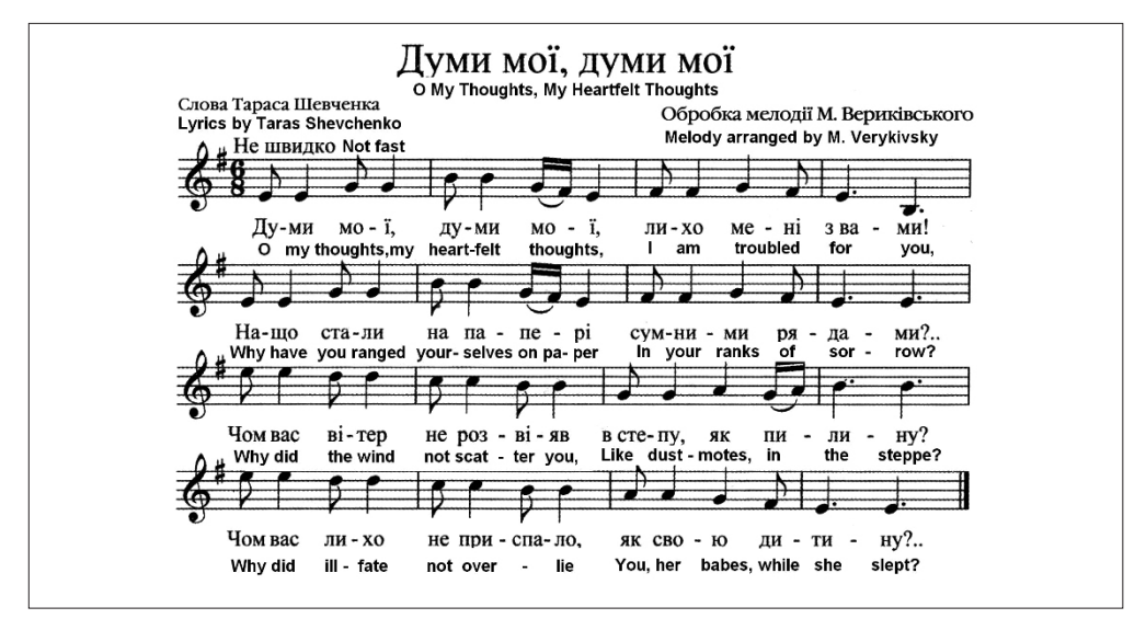
Fig. 3. "O my thoughts, my heartfelt thoughts, I am troubled for you…" put to music (based on Михалко 2009: 54)

The 2007 translation of the poem, shown here, is a recension of the 1961 edition. The prior text has been subjected by Rich to editor's changes in several places. A characteristic feature of both versions is that the translator inserts into the first line and the line-refrain an epithet "heartfelt", which pinpoints the author's contextual usage of the Ukrainian multi-meaning word "думи" (plural of "дума" that simultaneously means a sublime and solemn historical song and, figuratively, a ponderous and melancholic thought). Shevchenko himself imbues this word with a sense of intimate reflection on the destiny of his Ukrainian verses, as dear to his heart as only real living creatures could be. The speaking persona in the poem, who addresses his literary creations as his own children, cares about them as a father, and, as Rich aptly suggests in line 2 for the source phrase "лихо мені з вами", he is (very much) troubled for the songs from his heart. Shevchenko intercalated an emphatic particle "ж" in the above-cited set phrase ("лихо ж мені з вами") in the second edition of The Kobzar, which saw the light of day in the town of Chyhyryn in 1844, with the addition of the poem "Гайдамаки" ("The Haidamakas").