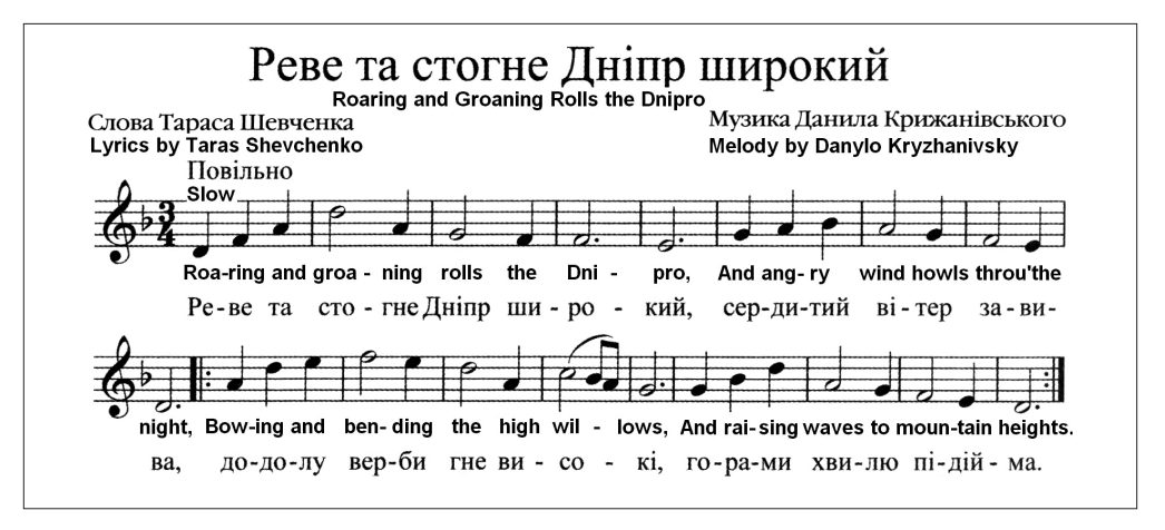
Fig. 2. "Roaring and groaning rolls the Dnipro..." put to music (based on Михалко 2009: 80)

The Romantics raised the popularity of a distinct national form of historical song, the dumas , eulogizing Ukraine's heroic past. This cult folklore genre was extolled by Shevchenko as one of the principal genres of his poetic works. Suffice it to mention here his first poetry collection, "The Kobzar", published in St. Petersburg in 1840, which included the poem "Думи мої, думи мої, лихо мені з вами…" ("O my thoughts, my heartfelt thoughts, I am troubled for you…") that served as a kind of epigraph (NB: the duma in Ukrainian means both a genre of historical folk-song and a solemn thought). Later it would turn into an epigraph not only to this particular edition but also across the entire poetic heritage of Shevchenko.