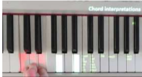
Fig. 5. Investigating ambiguous chords. The user enters a chord with three consecutive tones (C, D, E), which can be interpreted as Cadd9, C9, C9b5, D9, Dm9, Cmaj9, E7#5, D13, C69, dm11, am11, c11, D9#11, C/D, d9sus4, d9b5, a#9b5, c9#5, d11, cmaj13, fmaj13 and Bb9b5.

various degrees of a 9 th chord. Annotations are augmented on the keyboard frame of the keyboard to help the learner, that is, chord name, note names and scale degrees.