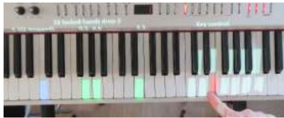
Fig. 2. Controlling the tuition with keys. A Locked-hands drop-2 in the key of E.