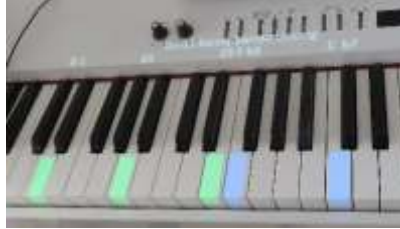
Fig. 1. A D11 minor Kenny Barron voicing. Note that two colors are used to differentiate the hands (green left and blue right).