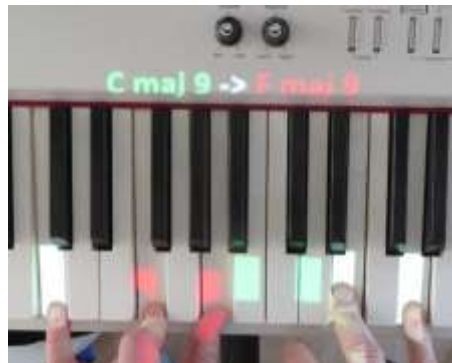
Fig. 4. Chord progression from C major 9 to F major 9.

However, the strength of the approach is the ability to visualize the musicians' freedom. Fig. 3 shows how all the keys of a keyboard that make up valid C9 chords are highlighted and how the learner can intuitively experiment with various inversions and moving of notes around. Fig. 3 shows how colors can be used to highlight the