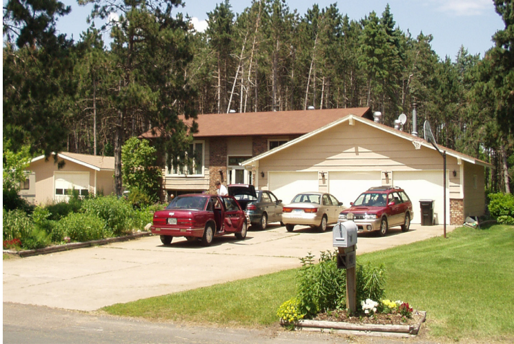
Fig. 3. Planetary stewardship begins at home; how many cars does one household need?