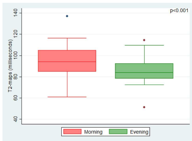
Figure 2. T2-values. This boxplot of the study population ( n = 25 ) shows significantly higher T2-values of intervertebral discs (IVDs) in magnetic resonance images (MRI) in the morning (red) than in the evening (green).