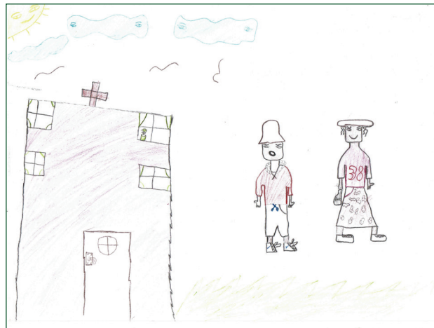
Figure 3: Drawing by P1

The participants' comments regarding their regular clinic visits varied from being positive, i.e., receiving medicine to keep them healthy (P5) and enjoy riding the lift at the clinic (P10), relishing the company of other children (P6), to being negative because of having to receive 'injections' (P9) and being bored there (P3). P3's boredom was evident from her self-portrait as an unsatisfied girl, which was related to the frustration of perpetuated inactivity while waiting to consult the doctor, which she wished could be countered by television viewing as distraction.