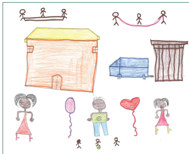
Figure 1: Drawing by P4