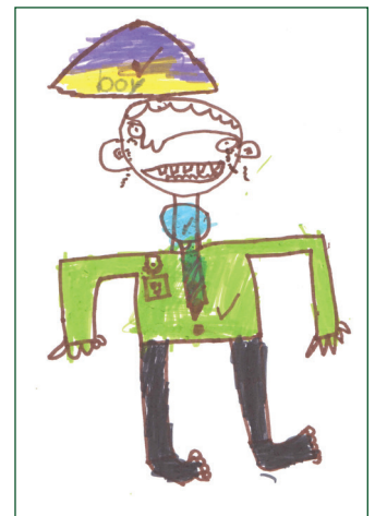
Figure 4: Drawing by P10

The persistence of stigmatisation for children living with HIV was confirmed by a comment from P1. In a drawing of him and his mother coming to the clinic for his regular treatment, P1 explained that his sad face was because "the people at the clinic are staring me down, they don't like me, I feel sad when they stare me down" . P1's awareness of stigmatisation, engendered by prejudice in his surrounding environment, subconsciously influenced him to experience every situation as judgemental (including his visits to the clinic) as it persistently reinforces his HIV status. With such awareness of social stigma engendering stigma internalisation, children inculcate society's negative views of them and their illness. This has a destructive impact on their self-image and is a major contributor to the high rates of depression which are prevalent amongst HIV-infected children.