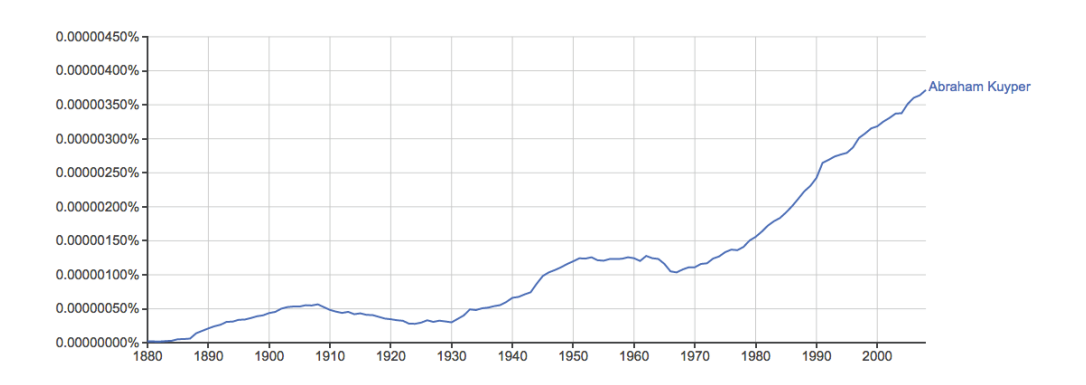
FIGURE 1. Graph of the number of works published in English that mention Kuyper. The y-axis percentage shows the books as a percentage of all books published.

As ever, the publication of works in English on Abraham Kuyper has not abated. The graph below – with data taken from Google books – shows increasing interest in Kuyper.