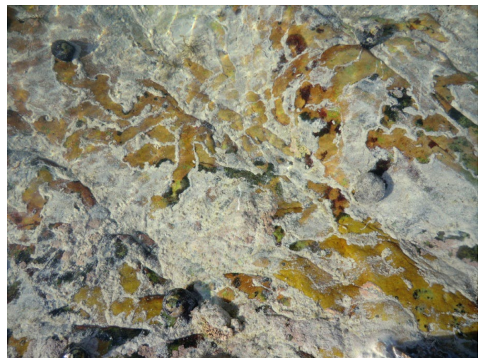
‘Sfumato by sea periwinkles.

Imaging idealises. “Artists tried to modify nature according to the idea of beauty they had formed when looking at classical statues – they ‘idealized’ the model” (Gombrich 2006: 244).