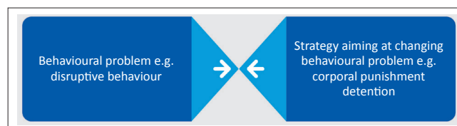
FIGURE 1: The conventional way in which researchers and scholars view learner-discipline problems.

In the fifth and final place, the educationist faced with a discipline problem should decide about the theoretical