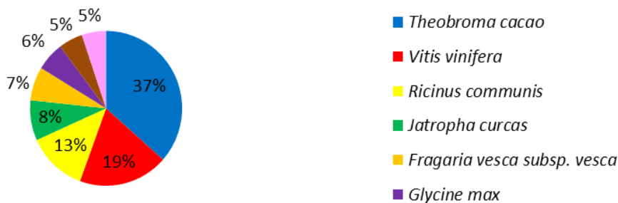
Figure 1. Unigenes functional annotation result for the top-hit species distribution for BLASTx matches for M. oleifera unigenes using the following order of priority databases: NR, TrEMBL and Swiss-Prot.

Out of the 182,588 transcripts, 67,558 (37%) were described in at least one database with high homology with unigenes from Theobroma cacao , 34,692 (19%) from Vitis vinifera , 23,737 (13%) from Ricinus communis , 14,607 (8%), from Jatropha curcas , 12,781 (7%) from Fragaria vesca , 10,955 (6%) from Glycine max , and 9,129 (5%) from both Cicer arietum and Solanum lycopersicum (Figure 1). The E-values are from 0 to >1E-5 (Figure 2). The aligned lengths of unigenes are mostly from 45 to 200 bp (Figure 3).