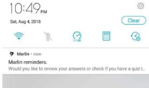
Figure 2. A set reminder notification for dismissed or missed quiz items.

We used the five concepts of a notification stated in the literature and tweaked the Ignore Notification feature into a Set Reminder when the user dismisses and ignores the quiz item. The Set Reminder feature is designed to remind the student of any unanswered items before the deadline. We opted to use these interactions to provide a byte size chunked of content as a notification for the user and set them to be personalized to their study habit with the time adaption algorithm.