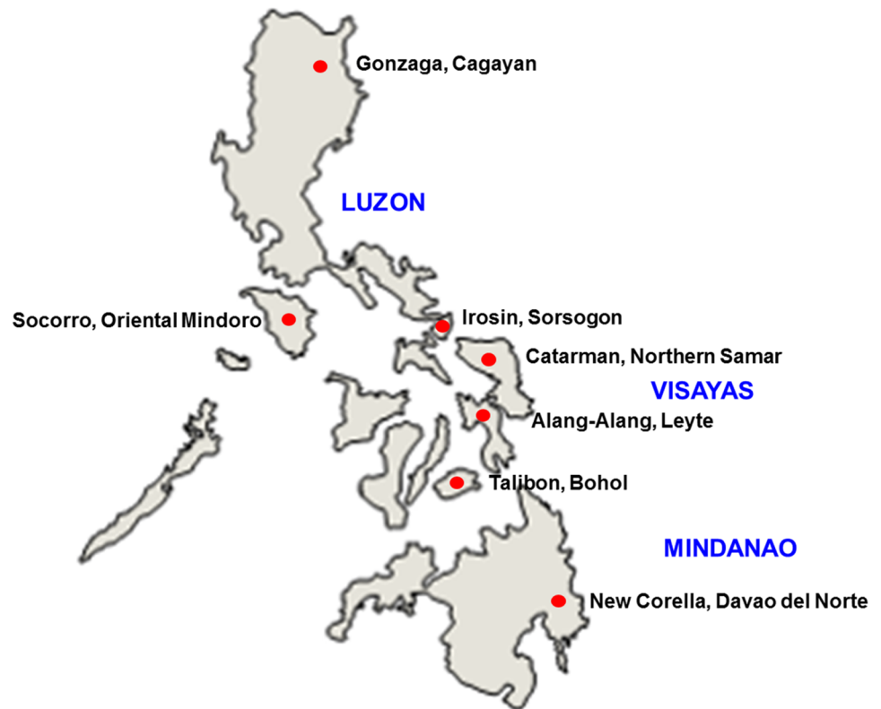
Fig 1. Study areas. The map shows the seven endemic municipalities in the Philippines included in this study. They are clustered into three major island groups Luzon, Visayas and Mindanao.

https://doi.org/10.1371/journal.pntd.0005749.g001