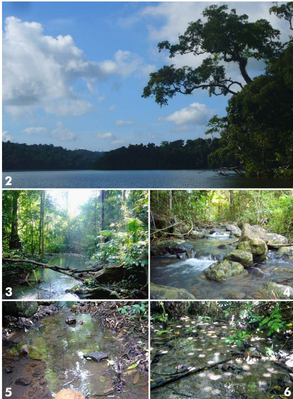
Figures 2–6. Lake Manguao scenery and particular stream microhabitats sampled. 2. Northwestern portion of Lake Manguao near Manguao Stream mouth; 3. Eastern Enolbong Creek with run sections (121a); 4. Eastern Sinangalit Creek with rocky riffle sections (73a); 5. Calm pool zones of the upper Manguao Stream (63a); 6. Helocrene in Malibongbong Forest (72a).