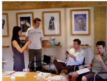
Fig. 3-2 Interaction with the toolkit