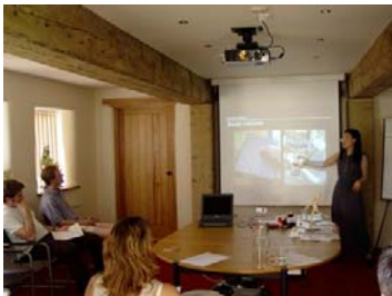
Fig. 3-1 Introduction to the toolkit