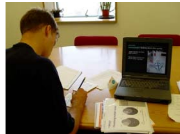
Fig. 3-3 Answering questionnaire