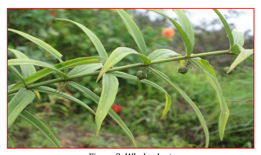
Figure 3: Whole plant