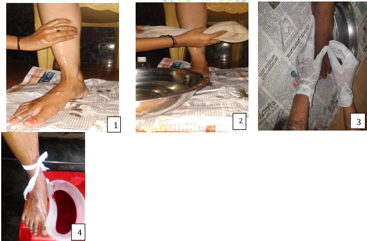
Fig.No:2 Procedure of Siravyadhana

1- Jalouka in fresh water 2- Jalouka in Haridra Jala 3- Covered the body of Jalouka with Pichu 4- horse-shoe shape neck of Jalouka showing proper sucking 5,6- Chardana of Jalouka