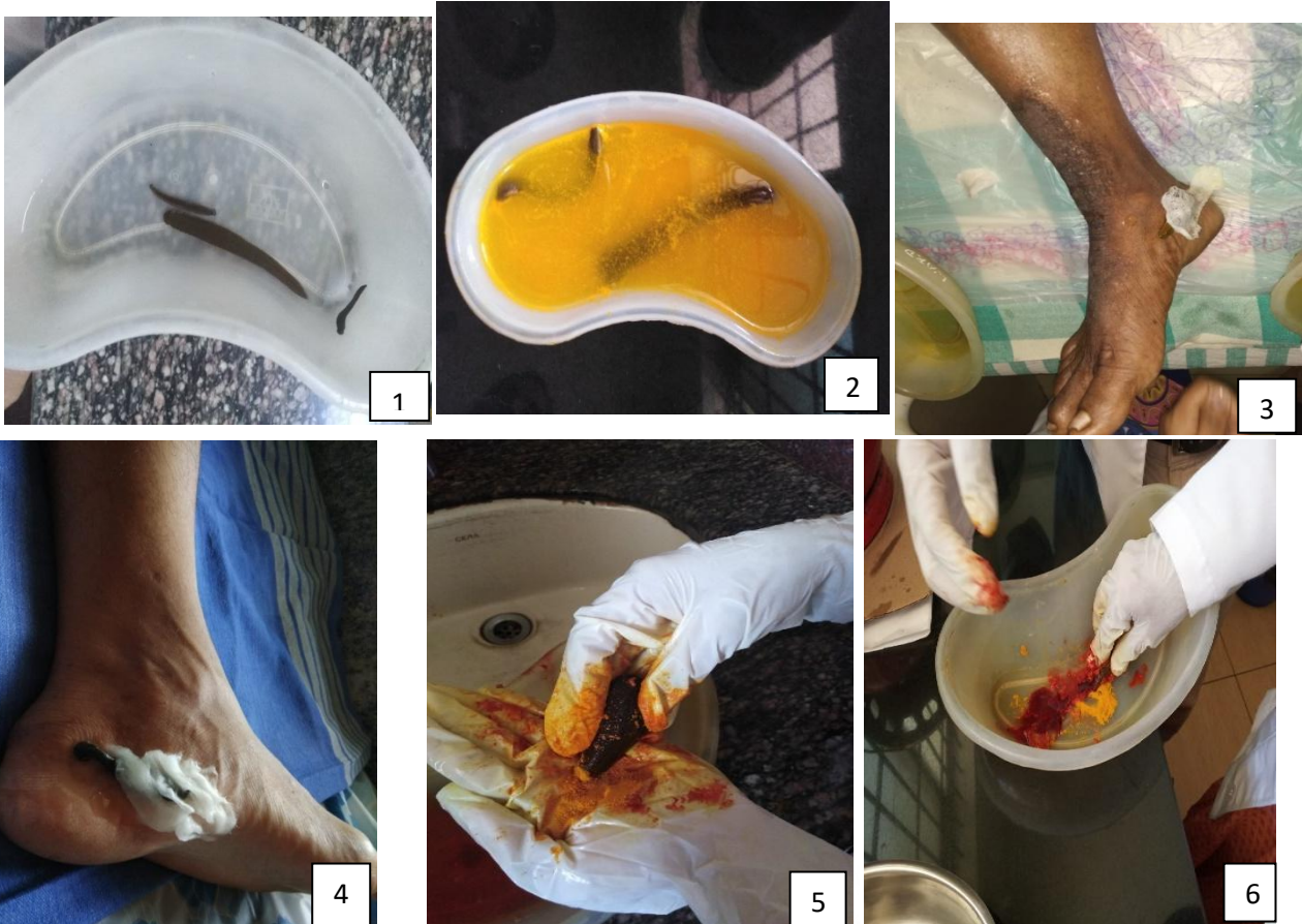
Fig No:1 Procedure of Jaloukavacharana

1- Jalouka in fresh water 2- Jalouka in Haridra Jala 3- Covered the body of Jalouka with Pichu 4- horse-shoe shape neck of Jalouka showing proper sucking 5,6- Chardana of Jalouka