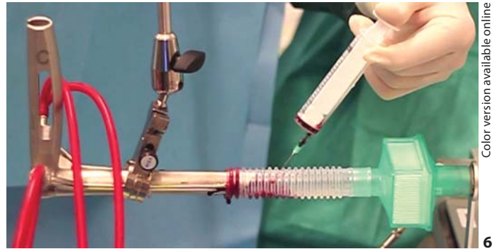
Fig. 5, 6. During the use of SHFJV, no backflow of blood from the trachea into the rigid endoscope (5) and jet laryngoscope (6) occurred. Transportation of blood into the lower respiratory tract did also not occur. Backflow of the exhaled gas and reflux of the

injected blood was caused by the remaining leakage between the rigid endoscope and the trachea. Additionally, continuous migration of injected blood towards the larynx was observed on the wall of the trachea.