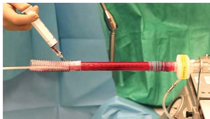
Fig. 7. During the application of blood and use of SHFJV with the 4-lumen jet catheter with caudal application of blood, swirling of blood within the trachea model occurred. The HME between the artificial trachea and the test lung remained untouched by blood until the reflux of blood and backflow of exhaled gas reached the entrainment area. From this area, blood was transported within the jet stream into the lower respiratory tract. Moreover, continuous migration of blood towards the larynx was observed on the tracheal wall.