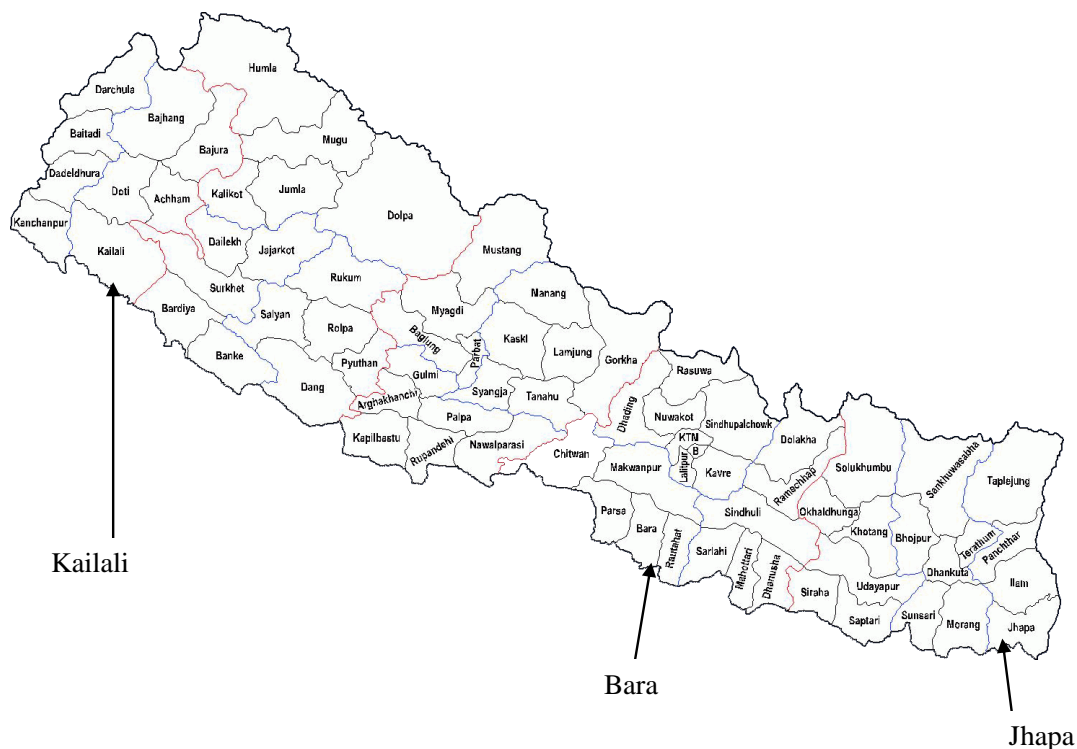
Figure 1. Map of Nepal showing Jhapa, Bara and Kailali districts.

Gross margin for any enterprise is the difference between the enterprise gross return and the variable cost incurred to that enterprise. The gross margin shows the clear picture whether the variable cost incurred in the production process is covered by the value of the product (Gujrati, 2003).