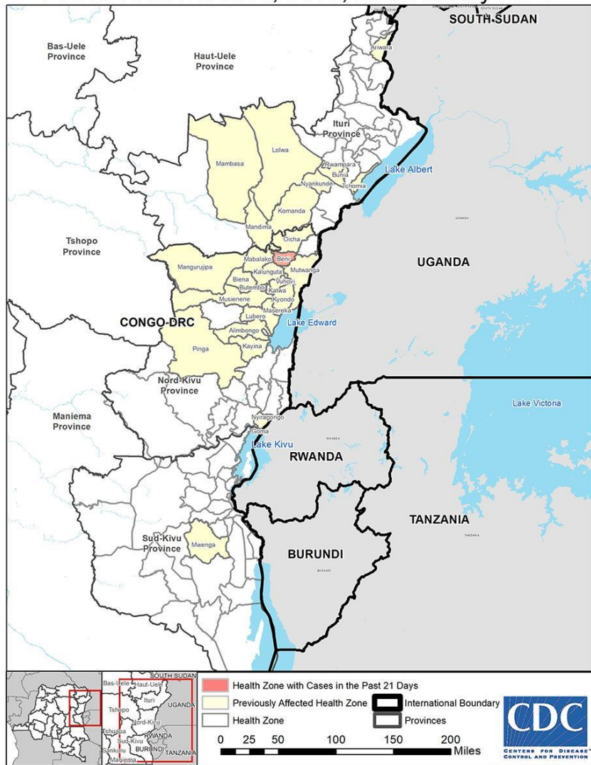
Map showing health zones previously affected by Ebola or affected by the disease at the time of the map’s creation on February 20, 2020.