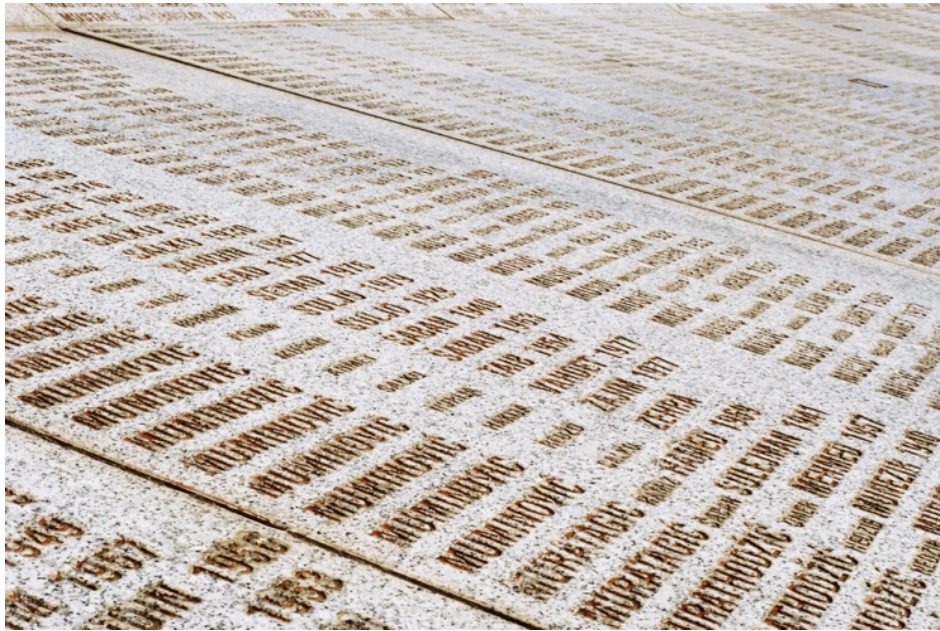
Pictured: Srebrenica-Potočari Memorial and Cemetery for the Victims of the 1995 Genocide. Around 8,300 victims are honored in the memorial and an estimated 1,000 more are believed to still remain hidden in mass graves throughout Bosnia and Herzegovina.