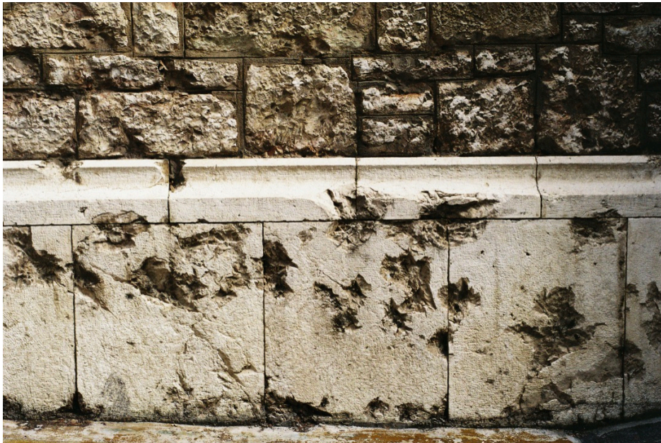
Pictured: Residual impacts of mortar attacks and shrapnel linger on buildings in Sarajevo's Old Town, formally known as Baščaršija.