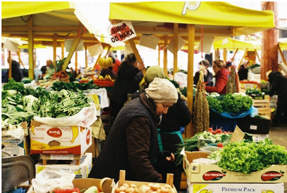
Pictured: Sarajevo's open-air market that experienced the most deadly mortar attack during the city's siege. The vibrant Pijaca Markale (the Markale Market) is currently full-functioning and offers a variety of seasonal fruits, vegetables, flowers, etc.