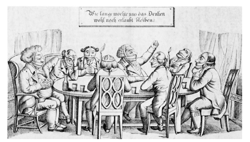
"The Thinkers' Club (1819). A famous caricature refers to the Carlsbad Decrees, which were implemented at the behest of Clemens Prince von Metternich. The decrees suppressed nationalist, liberal student fraternities and imposed tight restrictions on freedom of expression. The sign reads: "Important question to be considered in today's meeting: How long will we be allowed to think?"

the defense of a piece of original research—the dissertation—to grant Ph.D degrees. Along the way, German universities pioneered research seminars, methods of primary source research, and other features of the modern research institution. German methods spread internationally once German universities became magnets for foreign, especially American students.