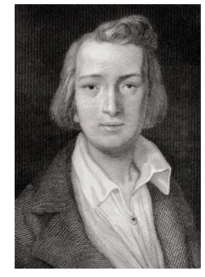
Heinrich Heine (1837)

The problem for censors, though, is that judging a writer's tone is more subjective than simply looking for forbidden words or ideas. Authors like Heinrich Heine made a name for themselves by mocking the follies of authorities through sophisticated literary tactics. Moreover, censors—like modern day college administrators—were condemned for allowing their own personal judgments and prejudices to color their decision making.