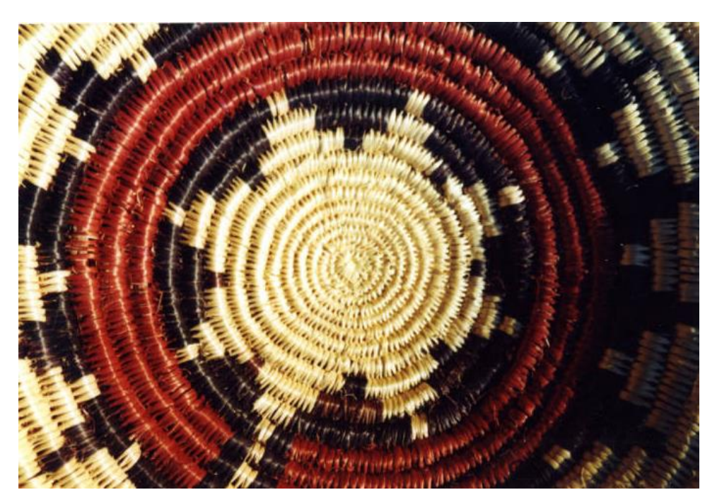
Figure~4:~Navajo~wedding~basket~with~traditional~motif-Source: \\ \underline{http://digital.lib.usu.edu/cdm/singleitem/collection/barretoelke/id/900/rec/16}

Without these personal metadata interviews, it would have been impossible to correctly identify the important details necessary for rich metadata — not only the date and time, names, locations and cultural significance, but the level of detail that only Toelken would know. He and his family provided an intimate level of crowdsourcing, yielding granularity, accuracy and quality for the data. An example of this is the Navajo Wedding Basket. The descriptive data for Toelken's image of a Navajo wedding basket illustrates the intricate work of creating metadata and the reason that it is beneficial to have direct access to the collector creator or community scholar who understands the value of the item, rather than relying on broad generalisations from library staff or unvetted community contributors for more information.