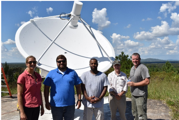
Figure 9. PDL Team installing first antenna in support of Kestrel Eye