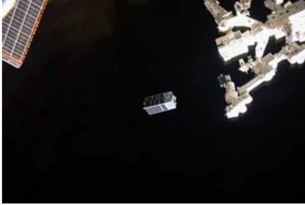
Figure 5. Kestrel Eye Deployment from ISS