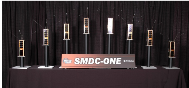
Figure 1. SMDC-Operational Nanosatellite Effect (ONE) spacecraft

The first of these units would launch within 19 months of delivery. An additional five SMDC-ONE spacecraft would go on to support Army missions while the remaining two were provided in a spirit of collaboration to support Navy small satellite efforts.