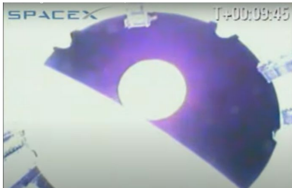
Figure 2. Satellite dispensers containing SMDC-ONE and payloads seen immediately after Dragon separation

The maiden launch of SMDC-ONE occurred in December 2010 aboard a Falcon 9 test flight as a secondary payload. SMDC-ONE was one of several secondary “CubeSat” payloads launched on the mission (Figure 2). SMDC-ONE was the second longest lasting of the payloads, remaining in orbit for 35 days.