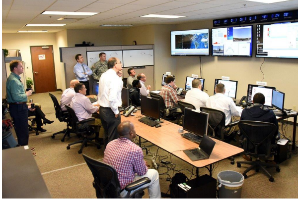
Figure 8. PDL Team conducting operations during the first pass of Kestrel Eye on orbit