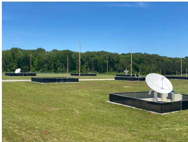
Figure 6. Redstone Arsenal Antenna Complex

In conjunction with the Redstone Arsenal Garrison, SMDC designed and developed an antenna complex on Redstone Arsenal (Figure 6), which was completed in May 2019. This complex provides a direct connection from the PDL to the antenna for the SMDC small satellite command and control and payload data downlink. Near term plans include the network connection to an OGA network providing several geographically diverse antenna positions as well as development of an offsite antenna location owned by SMDC. This design and near-term plan supports the initiative of providing low-cost, responsive data from space.