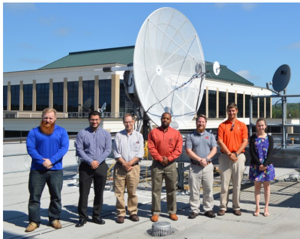
Figure 7. WALT Antenna

In addition to M&S and mission support, the CAL has performed multiple design and development projects. The CAL served as the primary source for personnel to design, fabricate, and perform check-outs of the Warfighter Assisting Low Earth Orbit Tracker (WALT) antenna which served as the primary ground station antenna for Kestrel Eye operations. 16 A picture of the WALT antenna is shown in Figure 7. The CAL also performed the design, fabrication testing and delivery of the first ACES-RED experiment, which at the time of writing, is mounted to the ISS collecting data on the performance of non-space-rated COTS hardware in space.