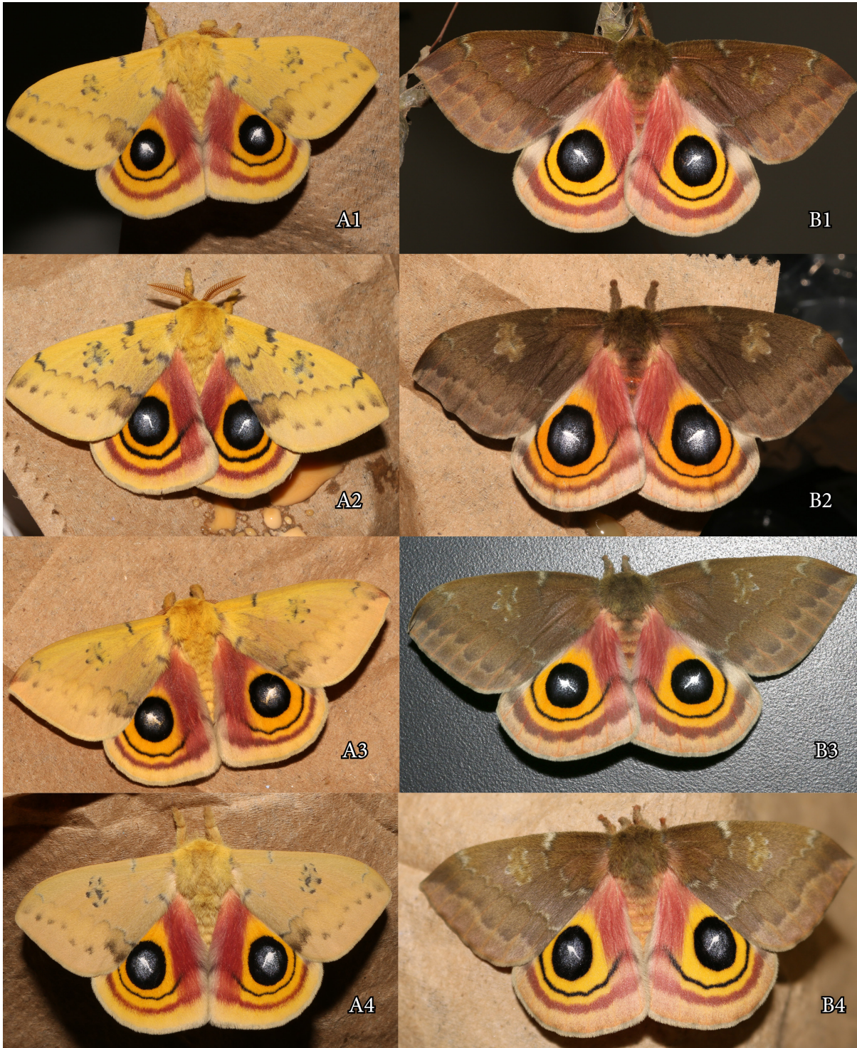
Figure S1. The F-1 hybrid Automeris 'iola' ( A. louisiana crossed with A. io from Texas). A) Males. B) Females. All represent four different crosses between female A. io and male A. louisiana except B4 represents a cross of female A. louisiana with male A. io .