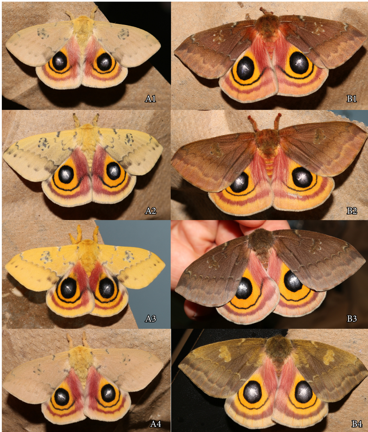
Figure S2. The F-2 hybrid Automeris 'iola' ( A. louisiana crossed with A. io from Texas). A) Males. B) Females. Two different hybrid broods are represented by siblings as follows: A1–A3, B1 and A4, B2–B4.