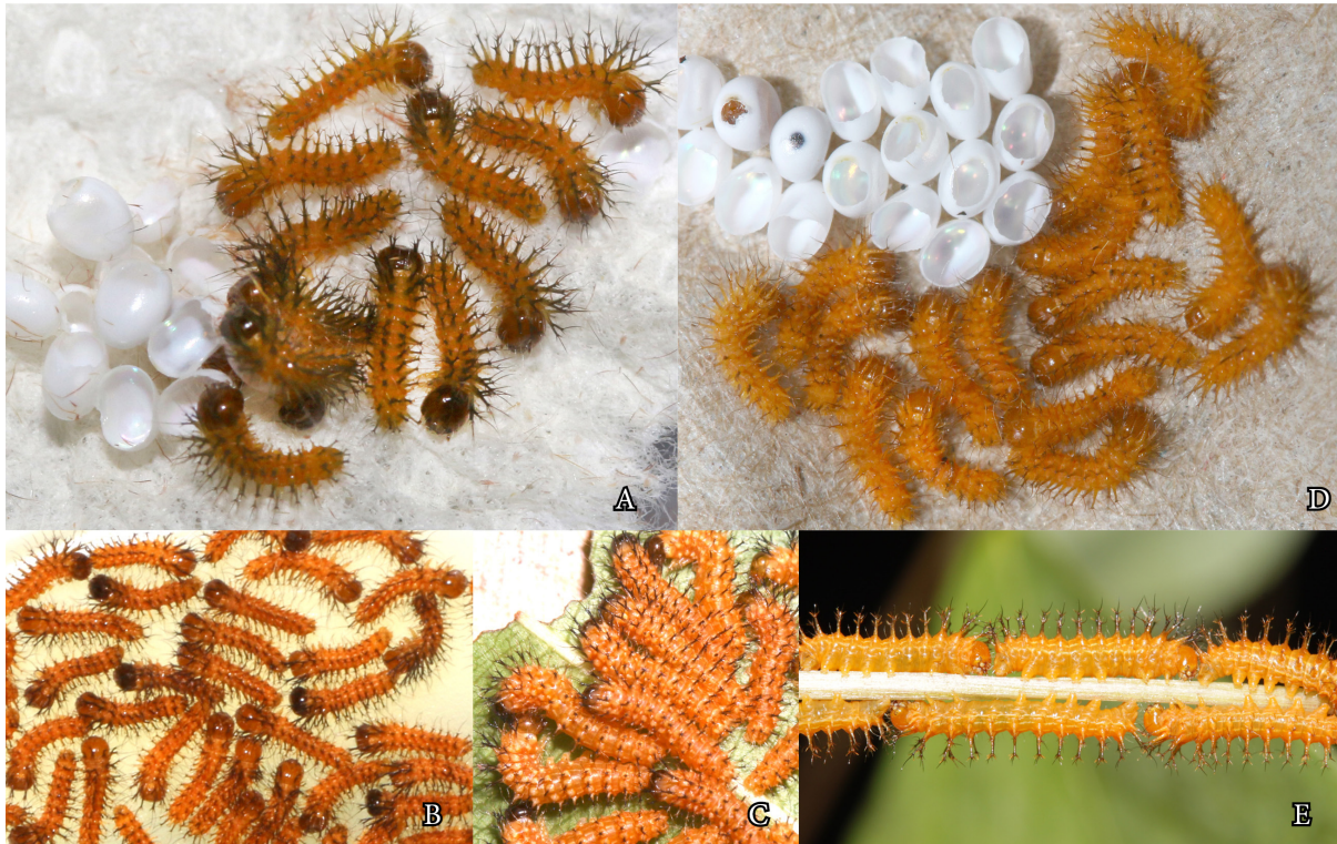
Figure 3. First instar larvae of hybrid Automeris ‘iola’ vs. A. io . A) F-1, neonate larvae. B) F-2 neonate larvae. C) F-3, molting to 2 nd instar. D) A. io , F-1 Texas X Florida cross. E) A. io , late 1 st instar, Florida.

While we crossed the two Automeris species repeatedly to determine the presence of post-zygotic isolation between them, and found that they interbreed, forming phenotypic intermediates, we do not consider this experiment significant enough for the taxonomic status of the two species to change, as there is ample evidence from their morphology and distribution that suggests they are well reproductively isolated in nature and not by the means of any geographical barrier. Since hybridization commonly occurs between different species of animals, from lions and tigers to Heliconius butterflies, both in the wild and in the lab, we see our experiments as another contribution to developing a more nuanced concept of species, which is far more complex than the short school-book definition of “populations that are unable to interbreed.” We encourage researchers working in the area of A. louisiana distribution to keep an eye out for unusual phenotypes of Automeris – perhaps hybridization between the two species studied here does occasionally occur in nature.