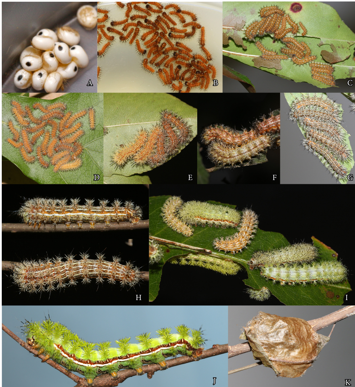
Figure 4. Life history of the hybrid Automeris 'iola' ( A. louisiana X A. io ). A) Fertile eggs. B) neonate larvae. C) late 1st instar. D) 2 nd instar. E, F) 3 rd instar. G, H) 4 th instar. I) 4 th and 5 th instar. J) mature larva. K) cocoon.

characters for screening for potential cryptic species and help inform taxonomic decisions. For instance, a difference of at least 3% between two geographically isolated and morphologically distinct populations may be safely considered a good indication of separate species (Lukhtanov et al. 2016), though some authors use a lower threshold. However, in the present case, the genetic distance between taxa is less than 1%, corresponding to normal intraspecific variation. From the alpha-taxonomy standpoint, such mt-DNA distance in barcode region would not support a separate species status. However, there are many examples of genera where mt-DNA barcodes are not useful in understanding species boundaries, and species are instead delimited using knowledge of biology, distribution, hybridization, and whole-genome analysis.