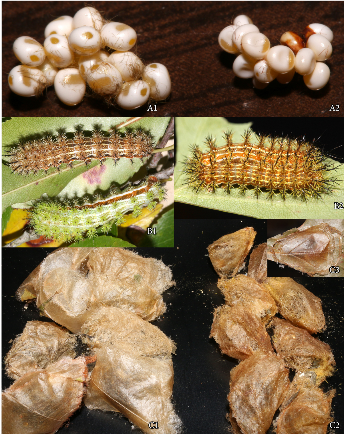
Figure 2. Observed differences in immature stages between the parental stocks of Automeris louisiana (left) and A. io (right). A) Eggs; in A. louisiana (A1), eggs are significantly larger than in A. io (A2). B) 4 th instar larvae; in A. louisiana (B1), they are dimorphic, chocolate-brown or pale-green with white stripes and with a maroon spiracular stripe, while in A. io (B2), they are always light brown. C) Cocoons; in A. louisiana (C1) they are lighter and appear tighter-woven than in A. io (C2 – Texas brood, C3 – Florida brood).