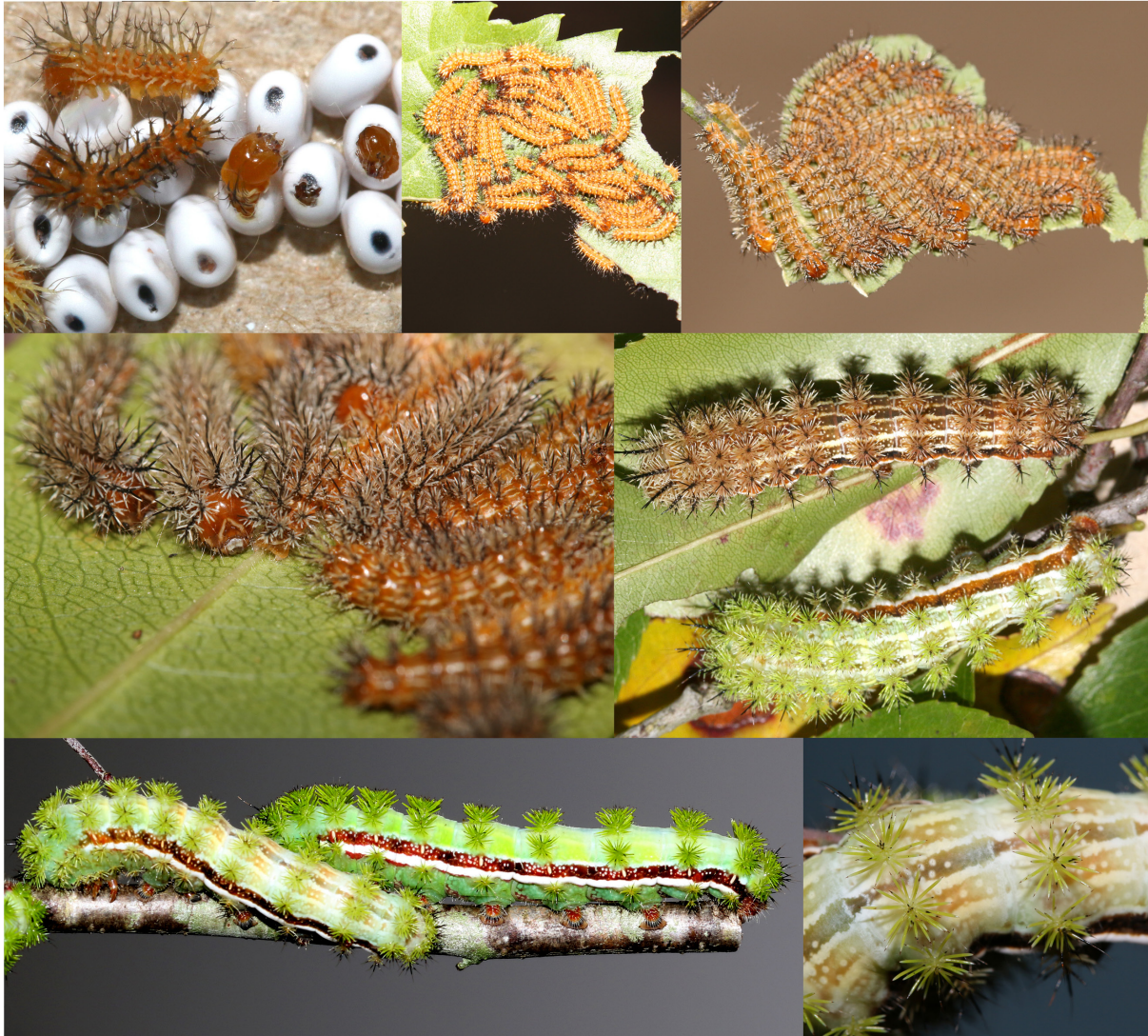
Figure S3. Immature stages of Automeris louisiana . Last instar larvae (bottom) occasionally exhibited pale-green dorsally patterned coloration that was not encountered in A. io .