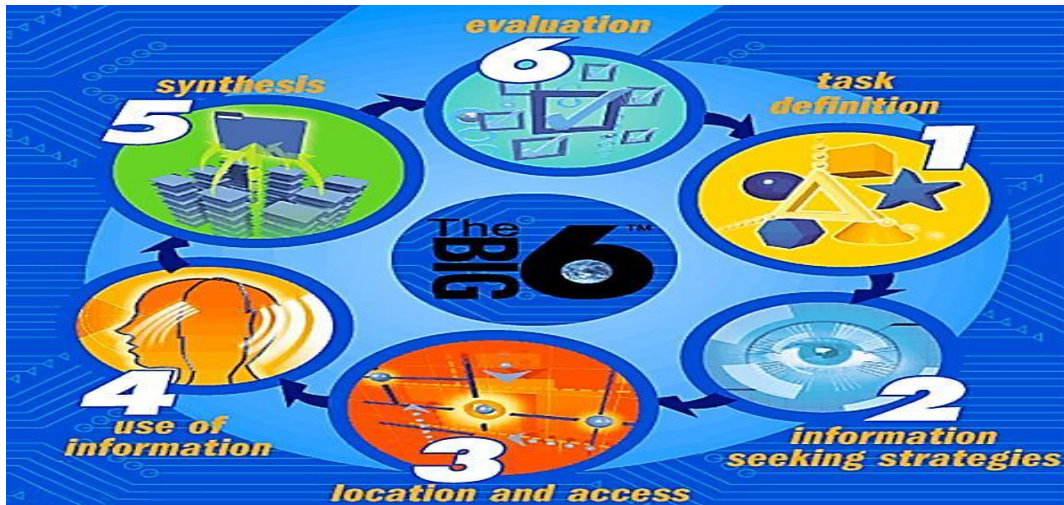
Figure 1: Big6 Model (Eisenberg, Johnson, and Berkowitz, 2010).