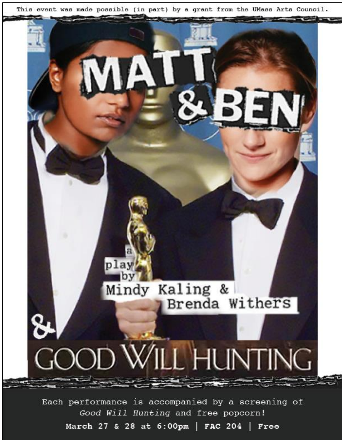
Figure 12. Matt & Ben & Good Will Hunting Poster