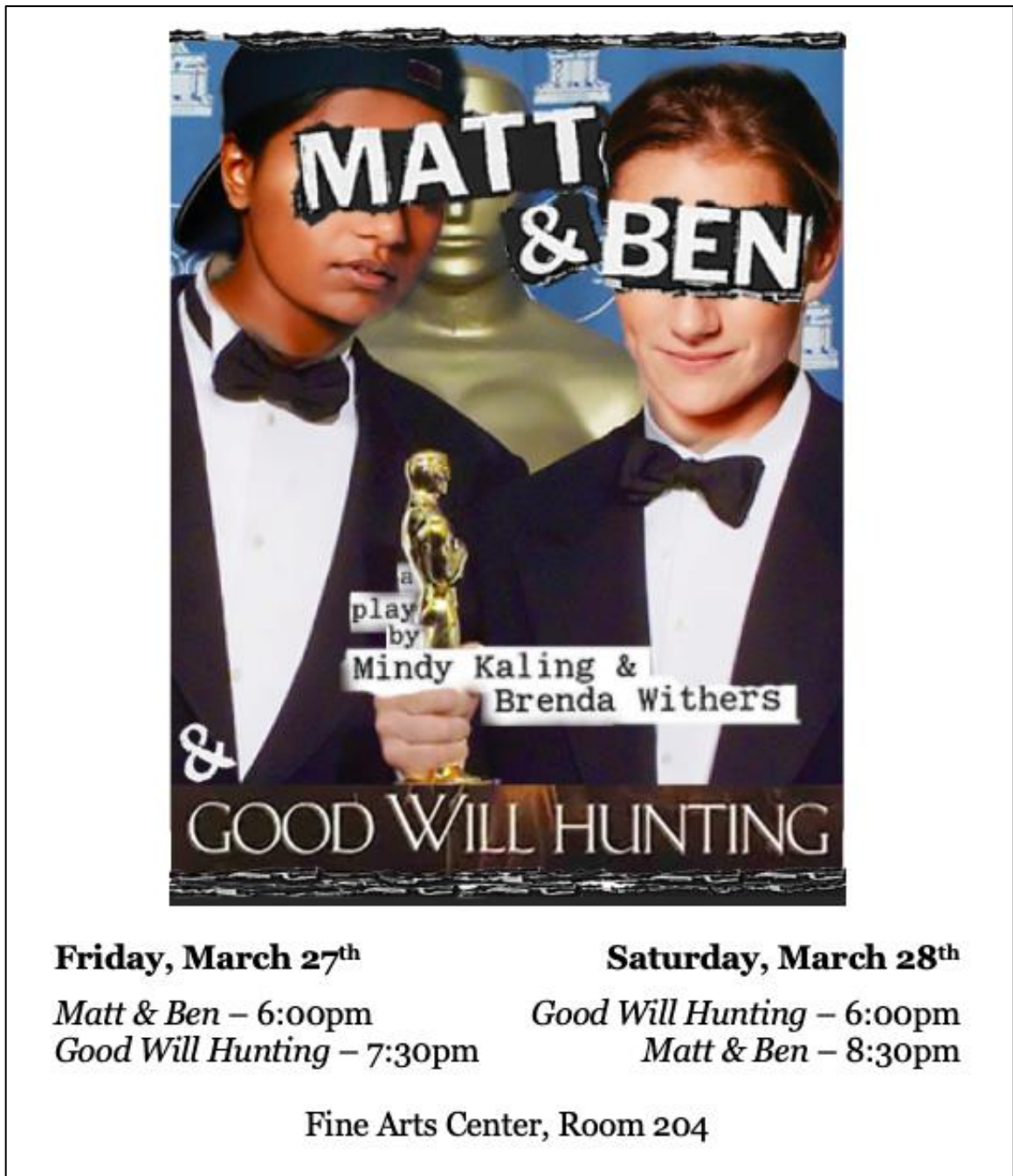
Figure 5. Front Page of Matt & Ben & Good Will Hunting Program