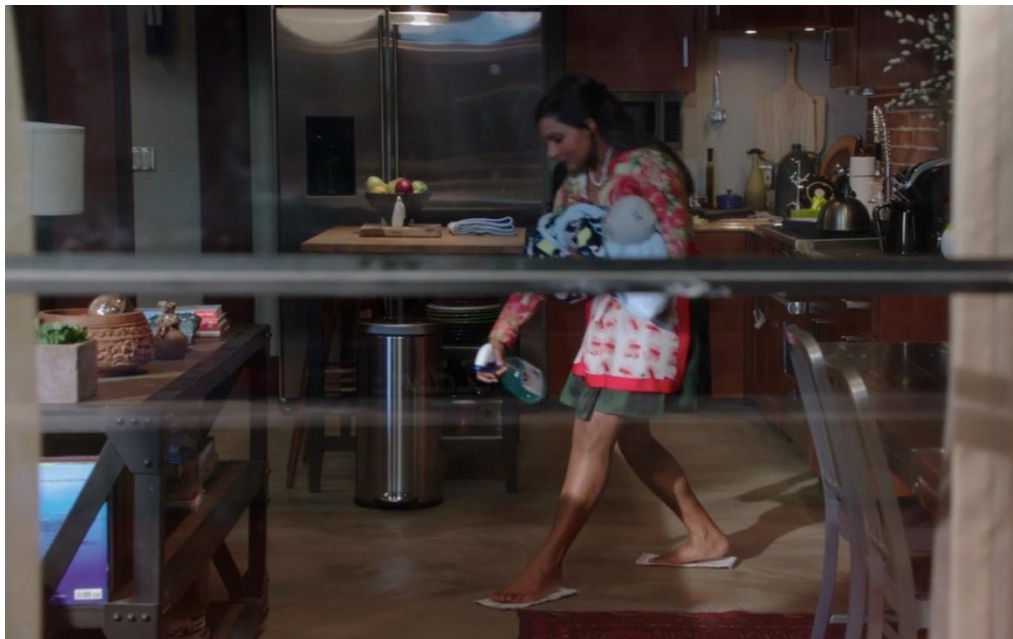
Figure 3. Mindy Kaling (Mindy Lahiri) in “Stay At Home MILF”

demands a place for women” providing the unruly woman “a space to act out the dilemmas of femininity” making laughable “the artifice of femininity” where there is a gap between the unrealistic role as portrayed and the complex reality of the woman playing the role (Karlyn 5 102). This occurs in The Mindy Project when Mindy is shown shaving her arms in preparation for a date or gliding around her apartment on Swiffer cleaning pads, sporting a full-face of make-up, well-coiffed hair, and pearls all while holding her newborn baby in her arms (see image below).