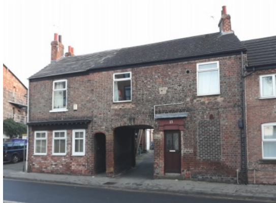
Figure 2. Thirteen Holgate Road, York, the Prest family home from 1873 to 1884 and location of York and District Field Naturalists' Society meetings.