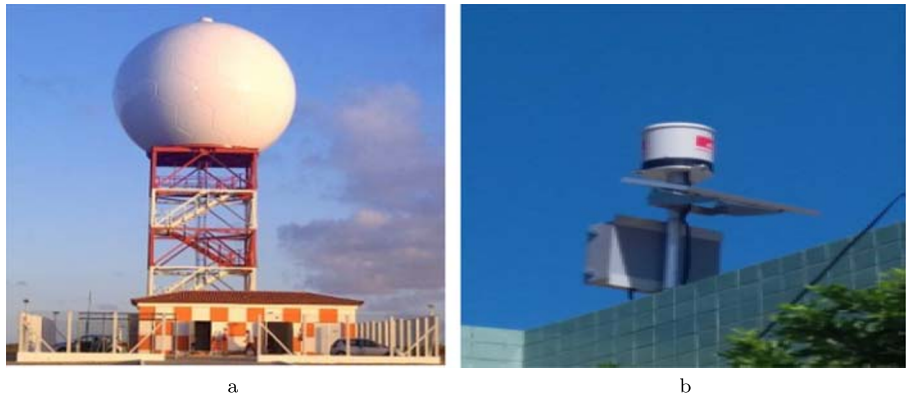
Fig. 2 IoT weather sensors of Cemaden. a Weather radar system. b Rainfall gauge.

utilise rainfall data as a basis for their analysis (Di Gregório et al. 2019). Using the IoT data and available models, the qualified experts of the control room assess the potential for a disaster and then both hydrologist and geologist operators decide whether to send a warning to the National Response Agency. The speed and accuracy of this decision making are vital because unless the warning is correct or reaches the Response Agency in time, proper response actions may not be triggered and the disaster may cause severe impacts on the local communities, including the loss of lives, property or damage of critical infrastructure. This explains why control room operators are continuously working under time pressure to make accurate and quick decisions.