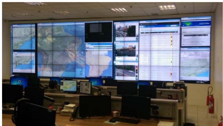
Fig. 3 Monitoring control room of Cemaden

As previously described, IoT weather sensors are used to support decision making in centralised control rooms. The following passage from a geologist (S2-3) working in the monitoring control room, explains the importance of IoT weather sensors as a key source of information to monitor local conditions even when they are not familiar with the actual location on the ground