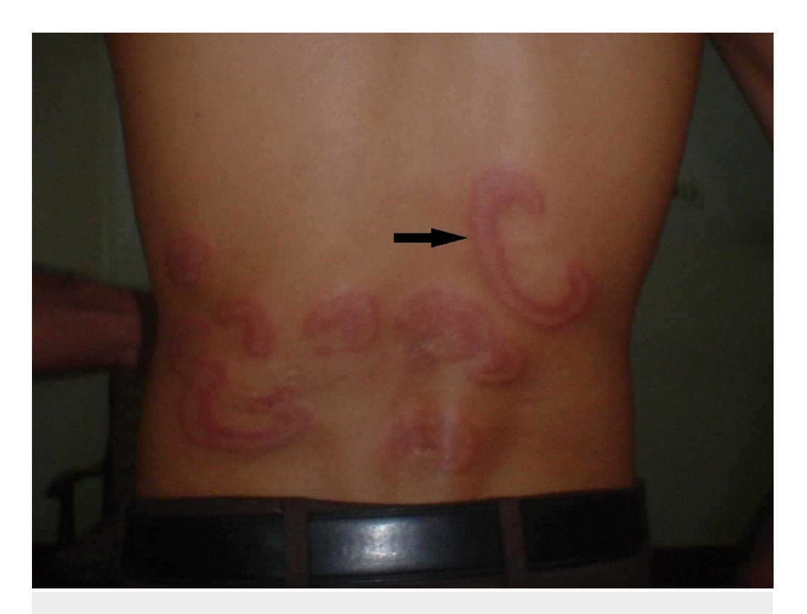
FIGURE 2: Figurate erythema with well-defined indurated borders on the back