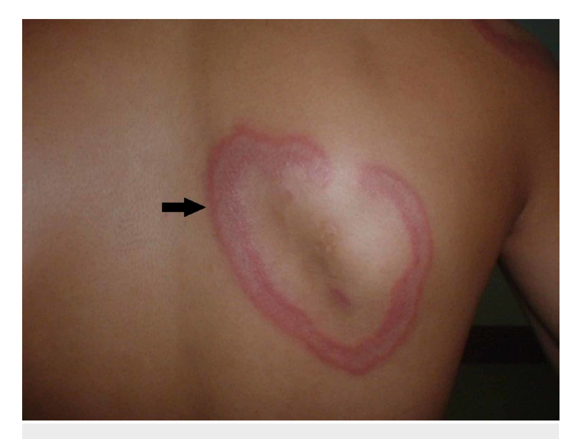
FIGURE 1: Annular erythematous plaque with central clearance

A 26-year-old male was referred to skin clinic with nine-month history of non-itchy persistent rashes over the body. They initially begin as small, raised papules and enlarged by peripheral extension to form annular lesions. After a variable time period of weeks and months, the individual lesions used to disappear, often to be replaced by new ones. It first appeared on his nose as small pink raised papule, which slowly enlarged and formed rings and gradually spread to his trunk and extremities. The lesions were asymptomatic, but they were cosmetically disturbing to the patient. He was recently diagnosed as a case of HT and referred from endocrinology clinic for his skin rash. There was no history of fever, weight loss, and insect bite, traveling or taking any new drug except oral thyroxin. Local examination revealed annular erythematous papules having raised infiltrated edges with central flattening and the fading of erythema (Figure 1).