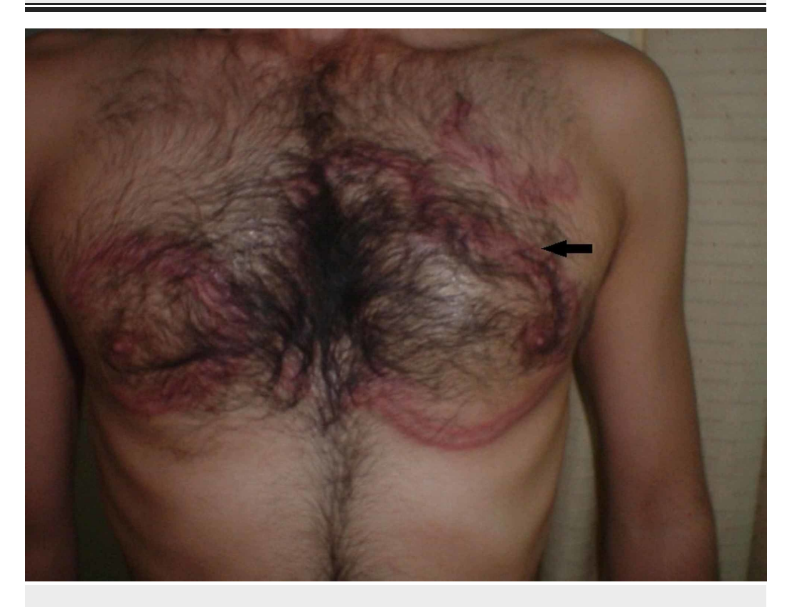
FIGURE 3: Figurate erythema with well-defined indurated borders on the chest