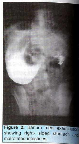
Figure 2: Barium meal examination showing right-sided stomach and malrotated intestines.

The term situs refers to spatial orientation of viscera. It is usually used in the context of cardiac and visceral connections. 4 A myriad of variations is described. Situs solitus is the normal condition of a left-sided heart, left sided aorta, atrioventricular and bronchial concordance along with right-sided liver, gallbladder and an uninterrupted inferior vena cava. 4 Abnormalities include situs inversus (a mirror image relative to the situs solitus, 4,5 heterotaxy syndromes (a variety of asplenia and polysplenia syndromes associated with variable viscerocardiac concordance and discordance), and isolated heterotaxy. The last is an asymptomatic condition