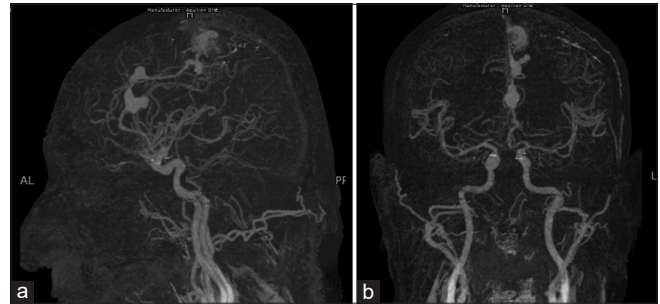
Figure 1: Head computed tomography angiogram at the time of presentation revealing a compact arteriovenous malformation in the left frontal lobe and three aneurysms in the distal anterior cerebral artery region. (a) Sagittal view, (b) coronal view.

The immediate postprocedural period was uneventful and uncomplicated. The patient, nevertheless, did not regain consciousness and was shifted to the ICU on controlled mechanical ventilation for further management and observation. Postoperative angiogram did not reveal any significant spasm. However, the patient's neurological status did not improve, and he died in the hospital following a complicated clinical course.