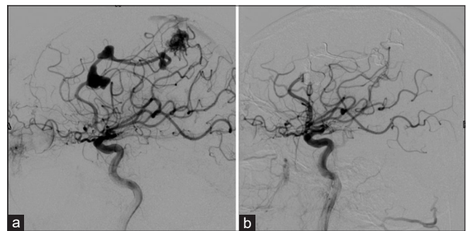
Figure 3: Digital subtraction angiogram before (a) and after (b) embolization of the malformation.