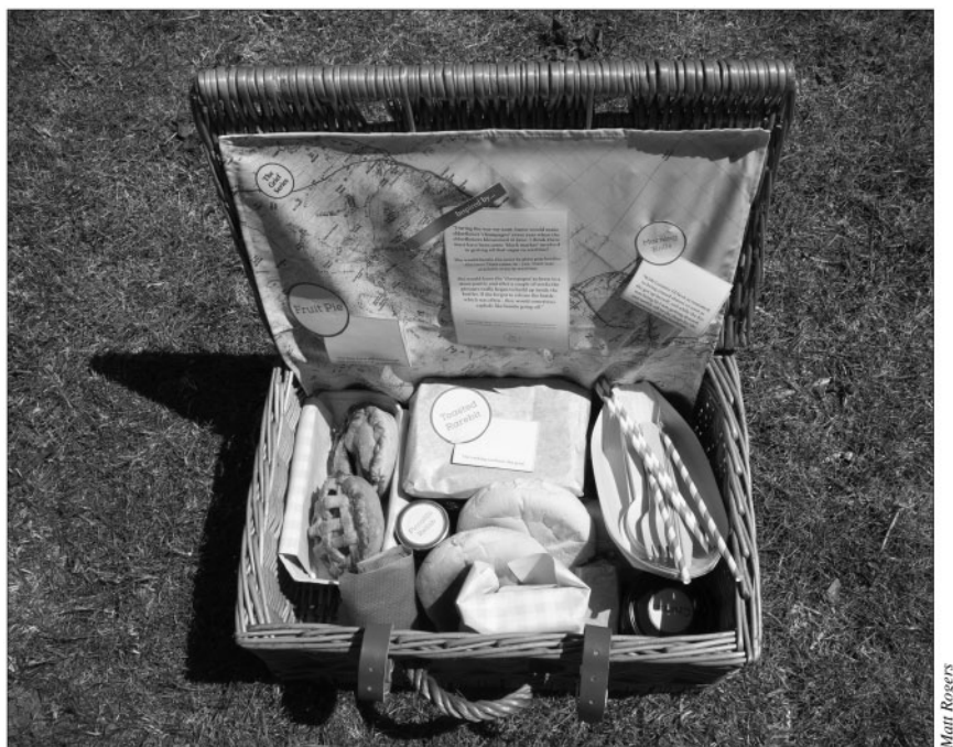
Fig. 7. The picnic hamper, featuring a range of food memories.