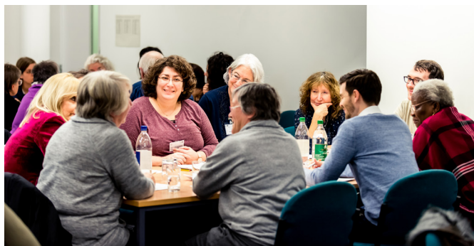
Figure 1 In the ‘Dragons’ Den’.

learnt, to help other researchers capitalise on the involvement of patients.