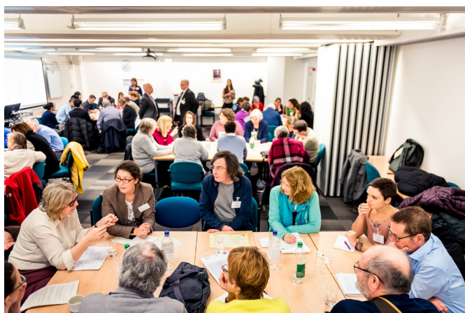
Figure 2 The Dragons’ Den session under way, showing the layout of the room used.

As epidemiologists, we try not to forget that each data point represents a person, but we need to re-examine whether we are asking the right questions of the