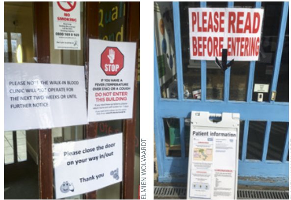
Figure 1 Hospitals and clinics should have clear information for patients to return home and self-isolate if they have symptoms. UK

The incubation period for COVID-19 is thought to range from 1 to 14 days, with symptom onset typically around 5 days; these estimates will be updated as more data becomes available. 4 Patients may be infectious before showing any symptoms, and some may show no symptoms at all. A person who has been in contact with someone known to have COVID-19 should self-isolate for 14 days, until such time as WHO guidance is updated. 4 It is important to follow national guidelines. Communicate this information to patients as early as possible, so that patients who need to self-isolate do not travel to the unit in the first place.