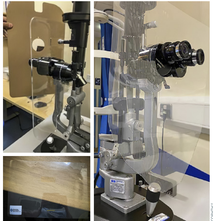
Figure 3 Slit lamp breath guards