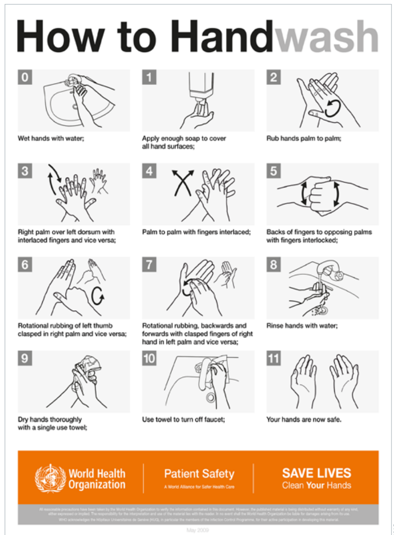
Figure 2 World Health Organization hand washing poster