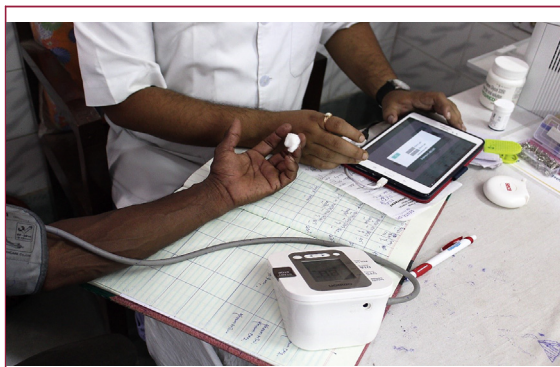
FIGURE 4. Noncommunicable diseases nurse using the mPower Heart electronic Clinical Decision Support System in the government health facility.

performing their duties effectively at NCD clinics. On-site visits to provide the orientation on mPower Heart e-CDSS to each important stakeholder (all doctors, pharmacist, staff nurses, and receptionists) in the health facility helped in early adoption of the intervention. Through refresher and on-site training, the project team built the confidence of the health care providers in the new intervention. This training ensured that NCD nurses were confident in using the technology and were aware that they would get support from project staff and administrative health authorities when required.