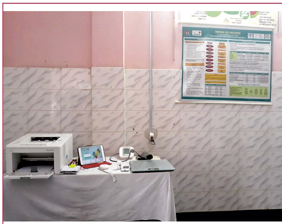
FIGURE 1. Equipment being used in a noncommunicable diseases clinic.