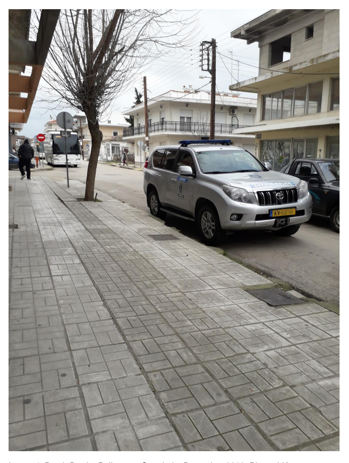
Image 4: Dutch Border Police car, Orestiada, December 2019.