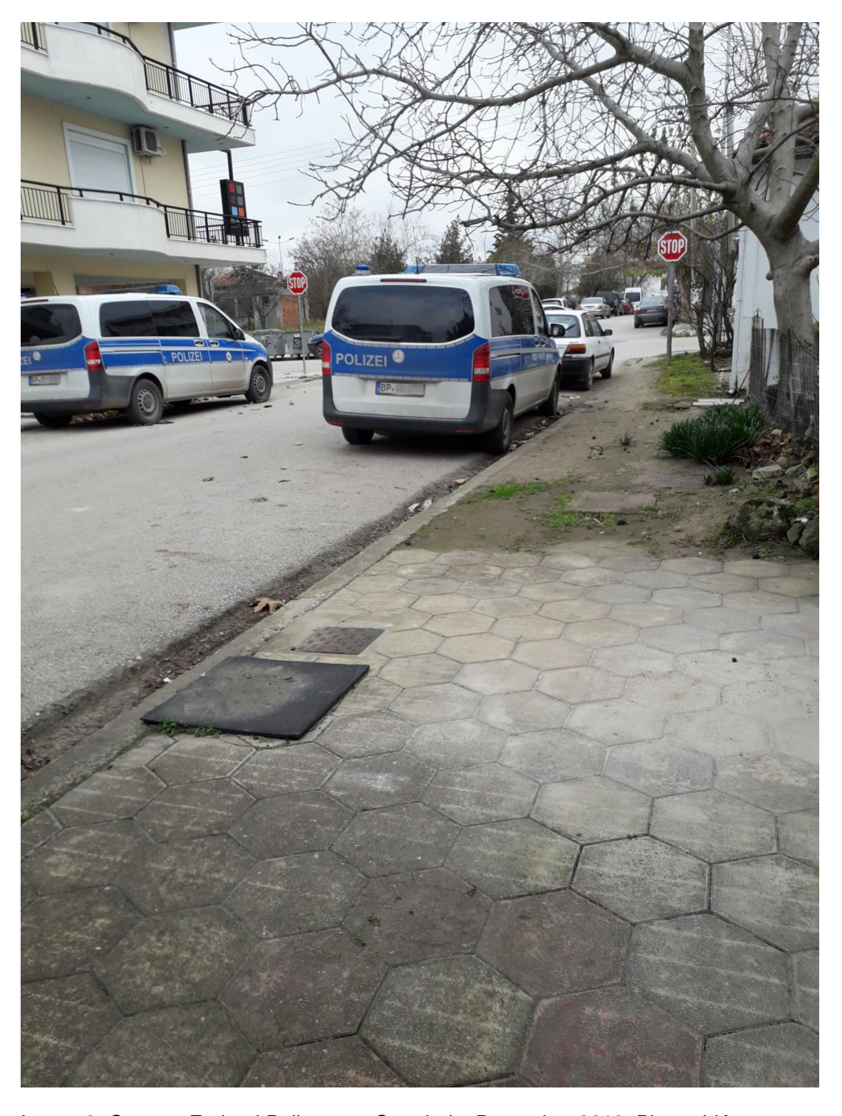
Image 3: German Federal Police van, Orestiada, December 2019.