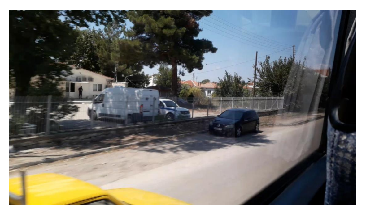
Image 5: White unmarked van, Neo Cheimonio Border Guard Station, August 2019.