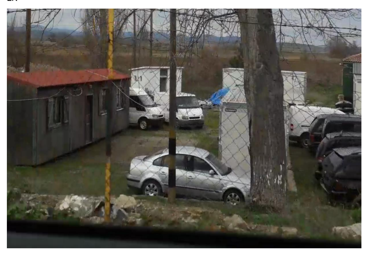
Image 6: White unmarked vans, Poros detention site, December 2019.