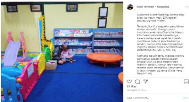
Figure 5. Sharenting by Creating Reading Interest in the Library