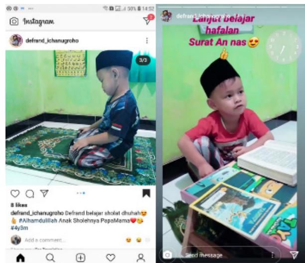
Figure 9. Sharenting Habit of Islamic Worship and Education

Sharenting with religious education and Islamic education habituation content carried out by the subject of this research is as shown in Figure 9. On her social media accounts, both on Instagram and Facebook, many share the activities of their children (DA) who are praying, learning to read, or DA activities are learning to memorize short letters. Sharenting regarding the worship habits and activities of Islamic religious education or inculcation of other religious becomes one of the Sharenting content that many millennial parents do. In connection with the motives of parents to share, share photos and videos of children who are praying for example, or children who are reciting, having an impact on parents being motivated to do the same to their children.