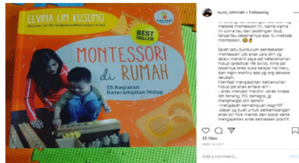
Figure 6. Sharenting by Creating Child Growth

knowledge/insight practices about parenting that they just get after seeing or knowing from sharenting that other people do. The attitude of parents towards children will change according to the intellectual ability of parents from the results of cognitive development [34]. Among the effects on parental attitudes on children are sharenting about child development and education, morals, and increasing parental religiosity. Sharenting about education can grow and develop children's potential [35,36]. The content of education about child development is also a content of sharenting by millennial parents. Discussions about children's growth and development are much discussed by parents and have an impact on changing attitudes of parents to children. In sharing what they do, they share knowledge about the way they do parenting by paying attention to the child's growth and development. Figure 6 shows the Sharenting conducted by the participants by growing and developing children's potential.