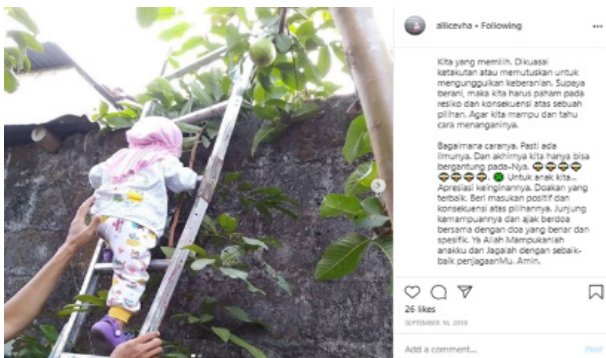
Figure 8. Teaching Simple Activities to Train Children Mentally

Meanwhile, parents have a different perspective and attitude about responding to their children who are climbing. Sometimes some parents forbid their children to climb because they are worried that it will endanger the child, and say the word prohibition that can kill the child's development potential. These events can be shown in Figure 8 below. Figure 8 shows the sharenting done by the participants by teaching children to climb trees to train the children's courage and mentality.