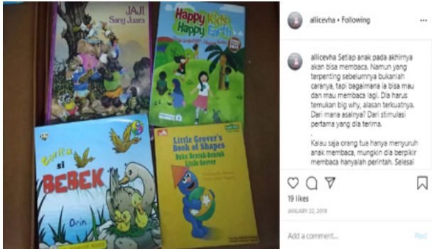
Figure 4. Sharenting by Creating Reading Interest in Children

social media account. In one of the posts on Instagram AF shared a photo of the book by providing information on educational writing to foster children's anger. Figure 4 shows the Sharenting conducted by the participants by invited children to go to the library and sharing photos about books that can be read with children.