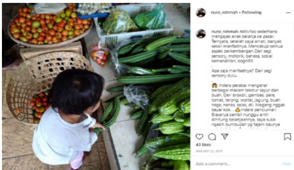
Figure 7. Doing Simple Activities to Children's Abilities Development

physical balance. I also share things that have already been experienced or done by themselves because there is more like that". Furthermore, Figure 7 shows the sharenting conducted by participants by carrying out daily activities in the form of buying goods in traditional markets. The sharenting activities shown in Figure 7 below have the aim to improve children's cognitive and psychomotor development, as well as increase social sensitivity in children.