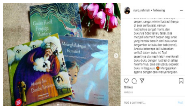
Figure 3. Sharenting by Invites Children go to The Library

reading, learning to read is not a burden for children, but rather something that is considered fun. Similar to AF, sharenting conducted by NR also contains educational content about growing love for children's books and readings. Related to the impact of sharenting on parents' cognitive that is done by NR who often invites children to go to the library, NR also shares photos of books that she recommends to read with children so that children have a love of books. Furthermore, Figure 3 shows the Sharenting conducted by the participants by invited children to go to the library and sharing photos about books that can be read with children.