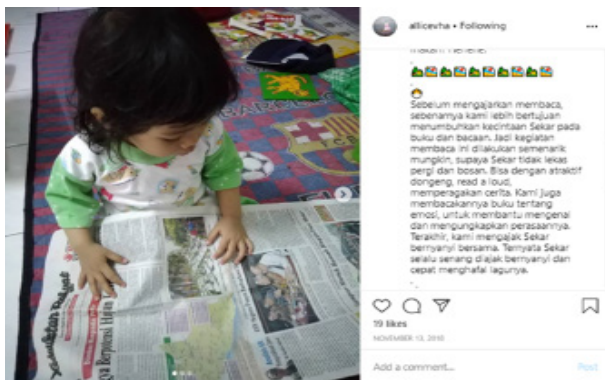
Figure 2. Sharenting by Reading Books Posted on Instagram

Among the examples of sharenting that have an impact on parents' cognitive are first, sharenting with educational content fosters a love of books and reading. As AF did on her social media account. Several posts share AF activities holding reading material, or photos of books that are given review comments. The post contains education to foster children's love of books and reading. As in one of her posts, AF wrote, "Before teaching reading, actually we are more aimed at fostering the love of SA in books and reading. Therefore, this reading activity is carried out as interesting as possible so that the SA does not go away quickly and get bored. It can be attractively tale, read aloud, read out We also read books about emotions to help identify and express their feelings" . Furthermore, Figure 2 shows the Sharenting conducted by the participants by conducting education to foster a love for books.