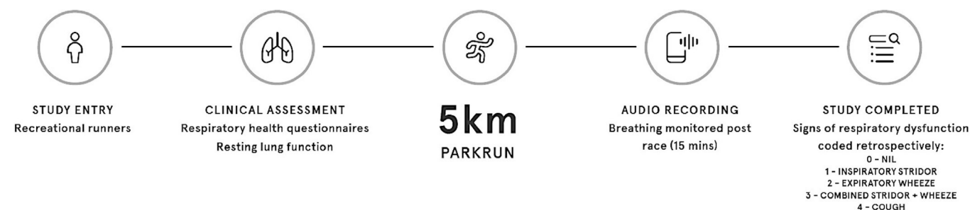
Figure 1 Schematic detailing experimental design.

Breathing sounds during exercise were self-recorded by the participant using an in-built audio-recording application on a smartphone. At the start of the race, participants launched the application in preparation to begin recording at peak exercise (ie, approaching and crossing the finish line) and immediately postrace for 15 min or until resting tidal breathing had resumed. To optimise signal-to-noise ratio (ie, minimise distortion and background noise), participants were instructed to hold the smartphone approximately 10–15 cm away from their