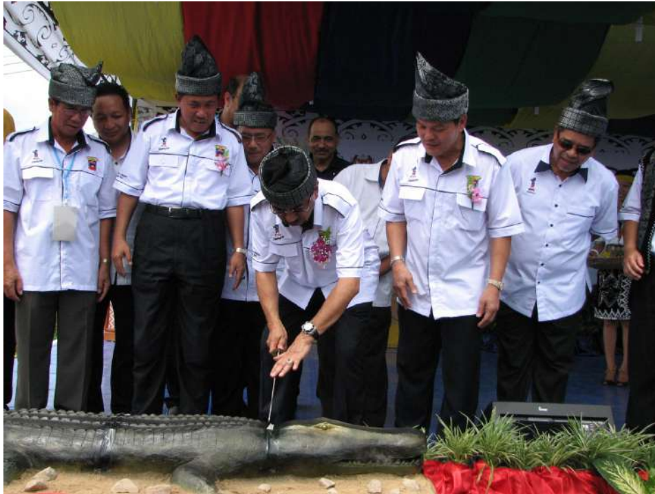
Symbolic : Chief Minister of Sabah, YAB Datuk Seri Panglima Musa Aman, officiates the closing of the Irau Rayeh Lundayeh 2010 by cutting the ulung buayeh replica made of fibre glass using the Lundayeh sword felefet .

As the concrete crocodile mound was very close to the volleyball court and not fenced, when the game was on, those who were waiting to take turn to play sat on the crocodile effigy. At the same time hard objects were used to knock the effigy's tail, legs and head. As a result it was damaged. There was no attempt to repair the damage image, so the village head decided that it would better be buried than having the ugly replica standing there 18 .