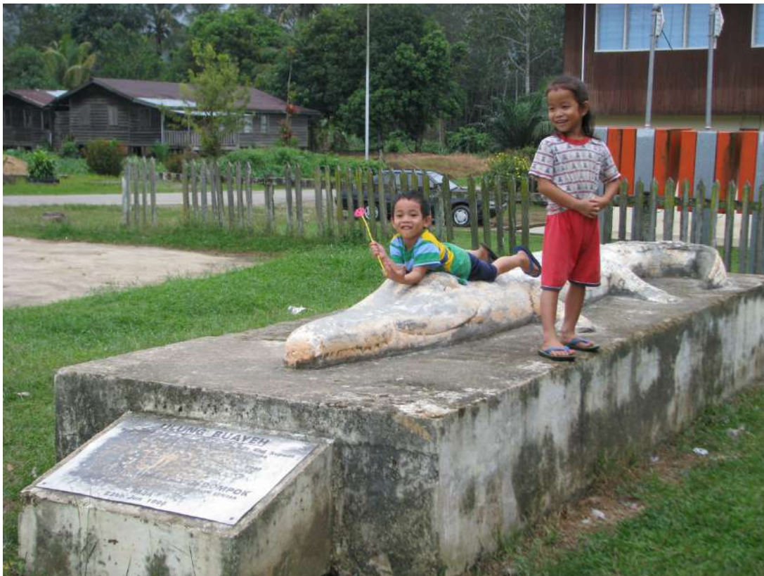
The concrete crocodile effigy at Kampung Mendulong, Sipitang

In 1996, a concrete crocodile effigy was erected by Sabah Forest Industries Sdn. Bhd. at Kampung Mendulong to mark the first grand Pesta Lundayeh Sabah held there. It was built very close to the Sidang Injil Borneo Church (SIB) building and in front of the Pastor's house where a volleyball court is also built.