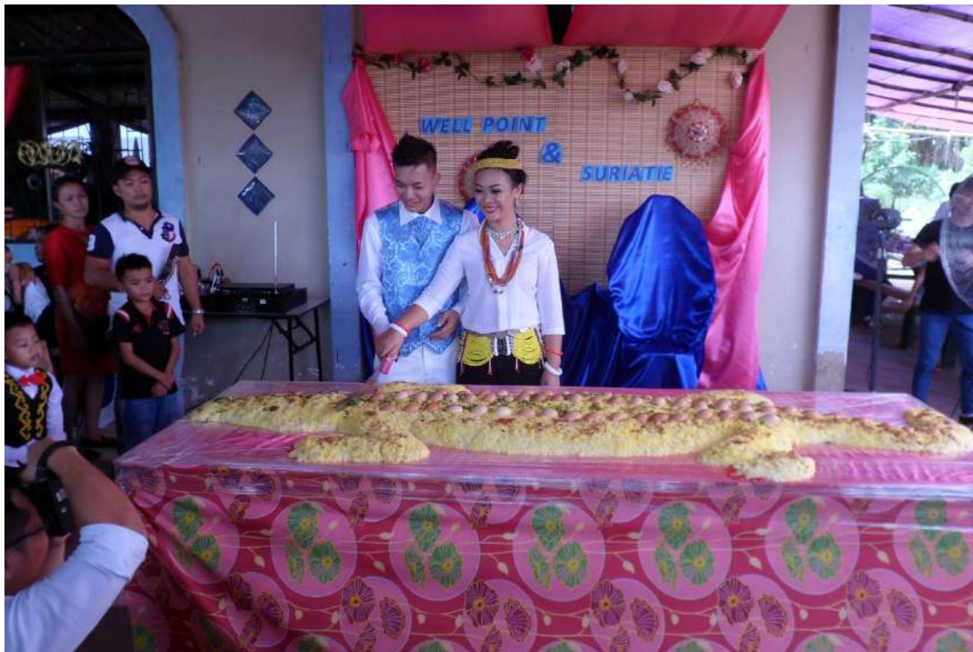
The bride and groom symbolically cut the luba' buayeh before the guests are allowed to take them like in buffet.

Luba' buayeh is made of boiled rice which is moulded into the shape of a crocodile. During Lundayeh wedding feast, the parents of the bride would prepare the luba' buayeh either on a long table or on a floor mat in the house. Boiled eggs and pork or beef is mixed with the rice. This is prepared especially for the parents and relatives of the bridegroom. Normally, luba' buayeh is not prepared unless there is a pre-arrangement between the families of the bride and bridegroom, as to make one is an additional cost for the family involved and unless the bridegroom is prepared to pay for it.