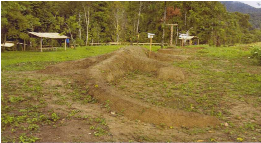
The earthen crocodile mound or Ulung Buayeh .

pushed back to the hills, and this includes the Lundayehs who retreated from thence to the mountains where they established their homeland 5 .