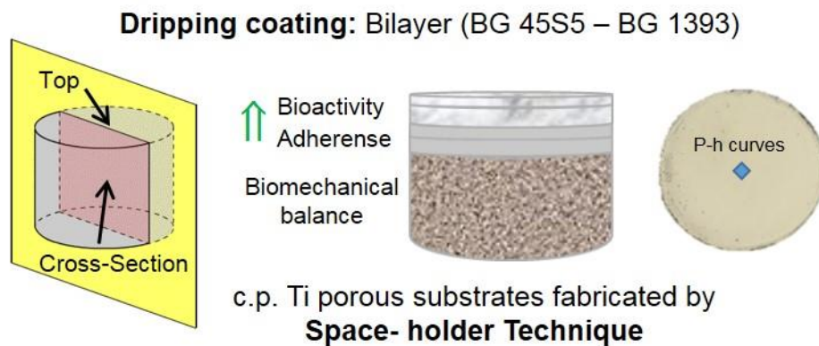
Figure 1: Scheme of a porous Ti substrate fabricated by space-holder technique, coated by the bilayer coating.