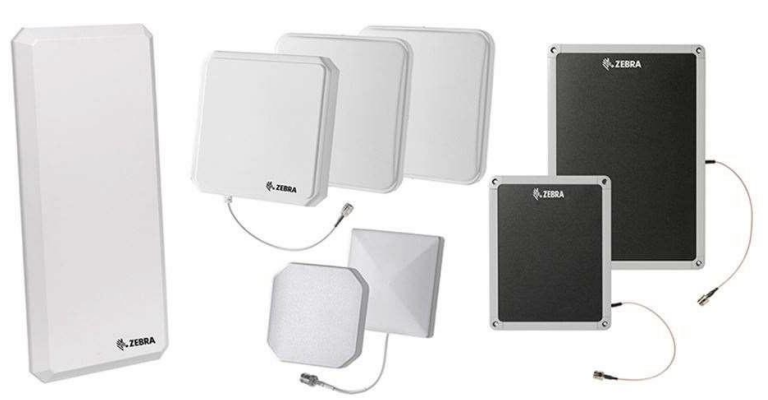
Figure 6. Different models of RFID antennas

The reader antennas are responsible for enabling the communication between the tag and the reader. The choice of antenna model and number will depend largely on the area to be covered for tag detection [18] [19]. Another important factor when choosing the antenna is to select the frequency range suitable for its use (figure 6).