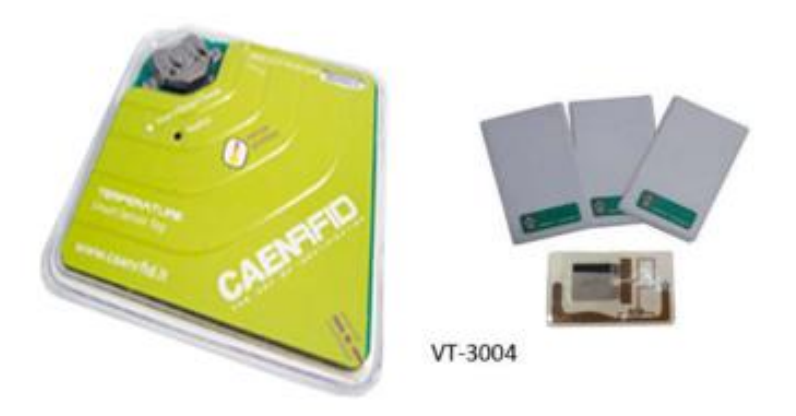
Figure 5. Examples of semi-passive tags.