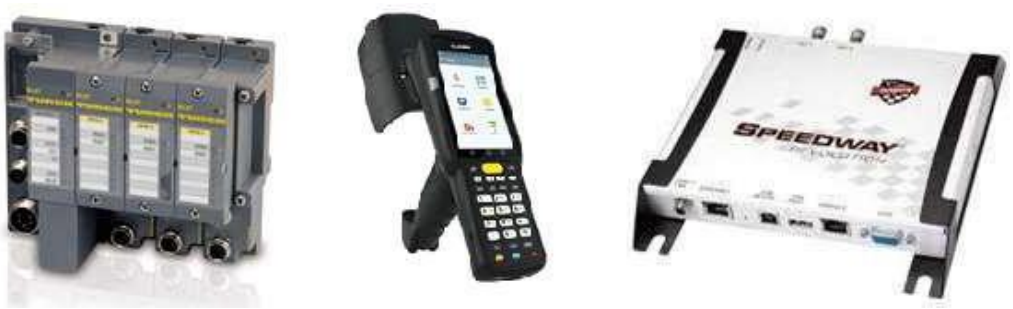
Figure 2: Examples of modular, portable and fixed readers.