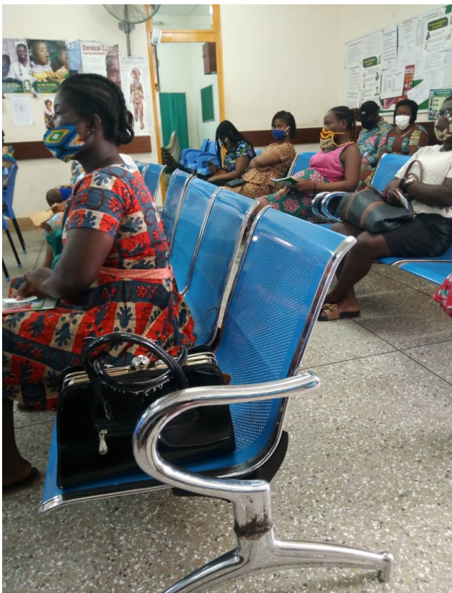
Photo: A group of Ghanaian pregnant women at the Ho Teaching Hospital (HTH) wearing masks and adhering to social distancing.

In this viewpoint, we briefly describe the precautions taken by the Ho Teaching Hospital (HTH) management as instituted by the Ministry of Health and the Ghana Health Service in line with recommendations from the WHO to limit the spread of the virus. Specifically, we looked at the precautionary measures taken to maintain quality antenatal care (ANC) delivery in the HTH, Ghana.