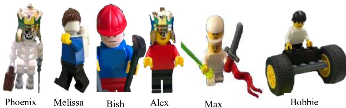
Figure 2. Participant's Lego models of themselves

In the following section, findings are presented as an interpretative phenomenological narrative to explicate both the process and content dimensions of our participants experiences as feelings of control, freedom and entrapment. In keeping with IPA's principles, theoretical assumptions are suspended and addressed in the discussion section.