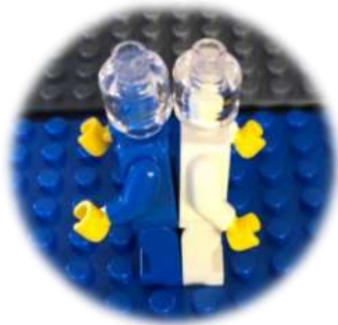
Figure 6. A Battle (Phoenix)

Wider constraints outside our participants control were also apparent in Phoenix's narrative. The battle between Phoenix's vision for what he desired his business to be 'a legacy', was at times experienced as a matter of frustration for him. '...If I was to go VAT registered here, I'd be shut with six months. And that's the government doing that to me. It's a constant battle'.