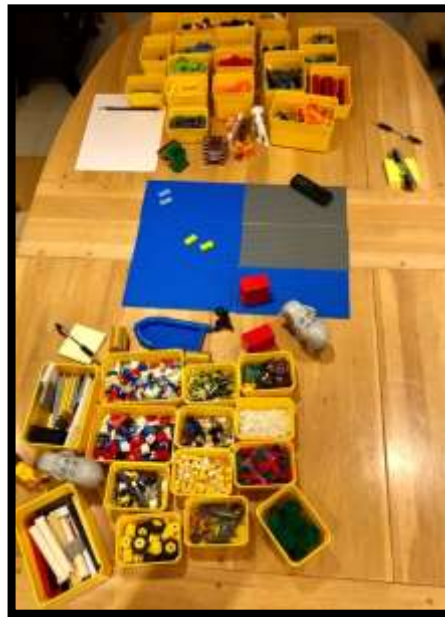
Figure 1 1 . Using Lego in an interview

IPA is systematic in its analytical procedures. Coding and thematising in IPA are based on a set of underlying principles (Smith et al., 2009) that involve: (1) movement from the descriptive to the more explicitly interpretative (coding); (2) moving from the specific to the thematic; and (3), from the case to the wider sample (identifying convergent and divergent themes). While there is a broadly outlined process to IPA (moving from the descriptive to the interpretative), the method does not ‘claim objectivity through the use of a detailed, formulaic procedure’ (Brocki and Waerden, 2006: 97).