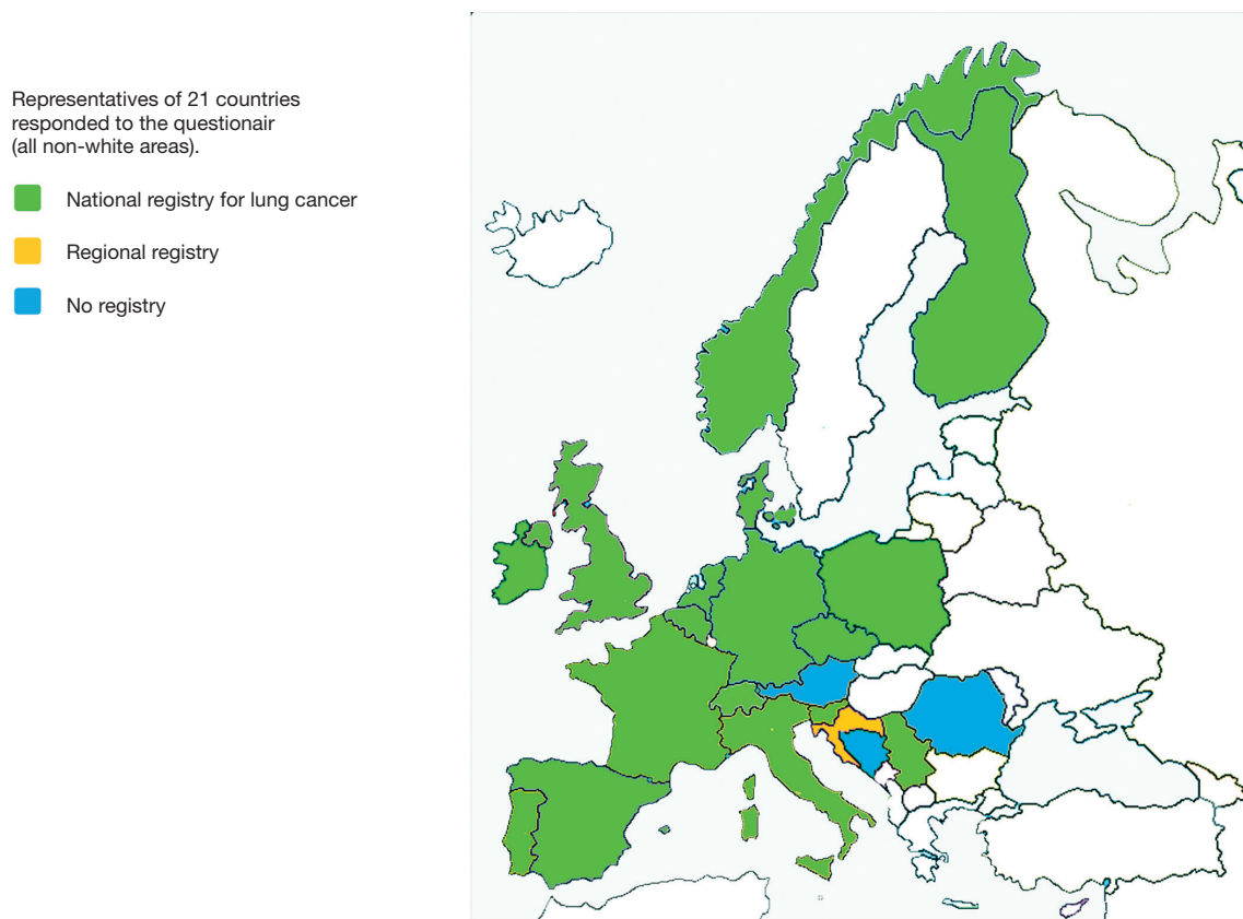
Figure 1 For 21 involved countries the presence of lung cancer registry is shown: national registry green, regional registry in yellow, no registry in blue, white areas did not participate in PPS meeting/“questionnaire”.

of this approach are (I) not all patients that may be eligible have predictive testing requested, (II) delay in predictive test results, as the test request by clinician is based on the availability of final histological diagnosis and (III) with no tissue management (see below), there is an increasing chance of an uninformative test outcome. Thus, in cases with small sample size with insufficient amount of remaining tumor cells, another biopsy may be necessary resulting in an additional delay. Of note, replacing the paraffin block in the microtome results in loss of tissue due to the uneven positioning in terms of \mu\text{m} , losing 10–100% of the remaining tumor biopsy sample.